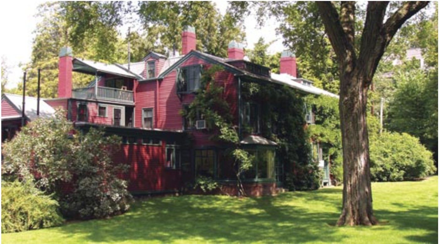
The Frederick Law Olmsted National Historic Site in Brookline, Massachusetts, served as home and office for the Olmsteds for about 80 years. In 1883, Frederick Sr. moved there and established “Fairsted,” the world’s first full-scale professional office for the practice of landscape design.

scene of his father’s earlier accomplishments, this time to assess whether the falls themselves could survive such dramatic attempts to siphon off their flow. Olmsted, who maintained a part-time residence in California, conducted a survey of potential park sites there in 1928; his report laid the basis for the elaborate state park system developed by California during the following decades; it became a model for other states. Olmsted also devised a master plan for saving the California redwoods. In 1932, Olmsted headed a special investigation to assess the suitability of the Everglades of southern Florida for national park status. Largely on the basis of his report, preservationists opposing the park because it was a swamp came to agree that its uniqueness lay in its sense of wildness and remoteness and that these features, coupled with wildlife, justified creating a park so dramatically different in physical structure from the wonderlands of the West.