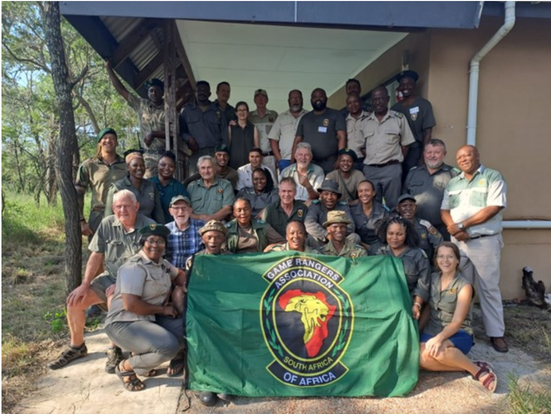
Game Ranger Association of Africa - General Annual Meeting

The Game Rangers Association of Africa (GRAA) knows that in order for the African ranger to work optimally in the field, he/she needs adequate training. Rangers need a diverse array of skills, which need to be maintained and developed. Through our Bursary Training Fund, we provide training based on needs assessments. This March the GRAA was able to train 16 ranger members from across South Africa and Zambia in the Braveheart Leadership Development course, presented at the Southern African Wildlife College in South Africa. The GRAA identified Braveheart as an essential course to develop and upskill ranger leaders. The purpose of this course is for these individuals to gain insight into the role of leadership in conservation and to provide them with the skills, knowledge and attitude necessary to add value to their specific job. The course focuses on: