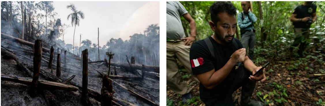
Illegal agricultural invasions, slash & burn of future farmlands.

During the last few months, as the rainy season came to an end, there has been an increase in illegal activities such as agricultural groups invading forestry concessions and unauthorized brazil nut harvesting, a product from primary rainforest. Junglekeepers' rangers have been monitoring the forest along the river and reporting illegal activities to the proper authorities. Our team of rangers are keeping the area they are protecting safe for thousands and thousands of species of wildlife.