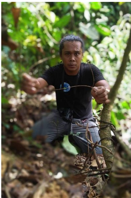
Image credit: Sumatran Ranger Project team member removing snares in the Leuser Ecosystem, Sumatra, Indonesia. (Courtesy of Sumatran Ranger Project).

Thin Green Line is working hard to raise funds for the next 12 months, to support more of the world's rangers. Our current project partners exemplify the diverse needs of ranger teams.