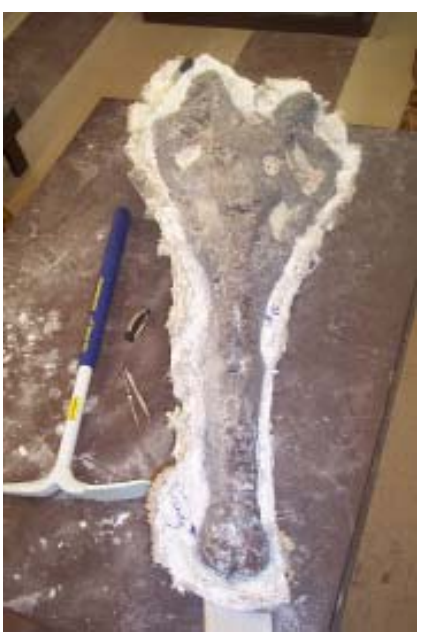
Leptosuchus – View of new skull being prepared.

about the morphology of this animal. Thank goodness we have our new preparation lab up and running.