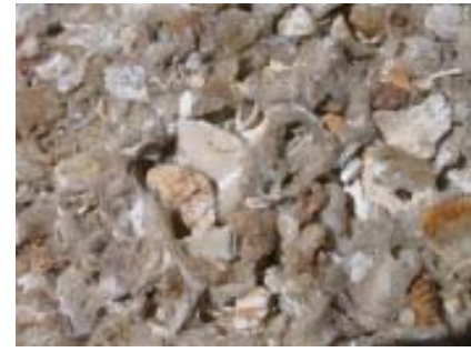
Closeup of coquina from the Anastasia Formation used in the construction of Castillo de San Marcos showng the fragments of fossil shells.

While coquina was used to build many houses and other structures by the Spanish its use in the construction of the fort was particularly advantageous. The rock is rather flexible and not brittle so did not readily crack during shelling by enemy ships, so cannon balls would bounce off the castle walls without causing major damage. Who would have thought that fossil shells from the Ice Age would be just the right material to stand up to heavy shelling.