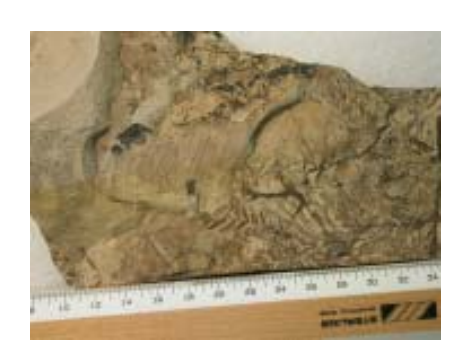
Block of lacustrine shale showing examples of Sequoia and Alnus foliage collected from WRST

What we concluded from our expedition was that like Alaska itself with its untouched splendor and extreme vastness, the potential fossil resources in WRST indeed live up to those standards. Of the park's 14 million acres, those which are not covered in ice have the potential to yield fossils from all eras of the geologic timescale. We are lucky to have such an area already protected as a National Park, and we look forward with great anticipation to the new scientific discoveries that have yet to be made within its boundaries.