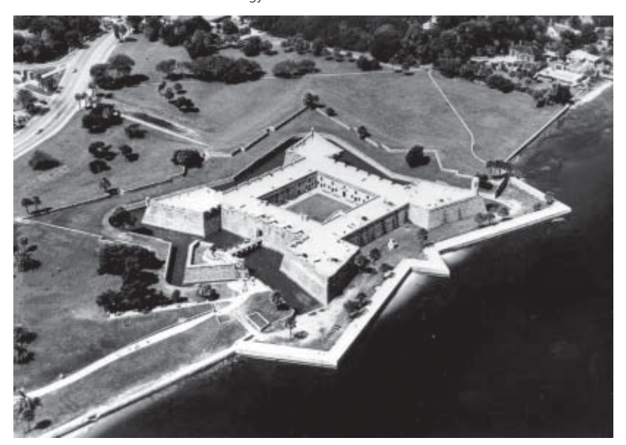
Aerial view of Castillo de San Marcos in St. Augustine Florida. Built by Spain from 1672 to 1695 the present fort is constructed of blocks of coquina and replaced nine successive wooden forts which had protected the city since its founding in 1565.