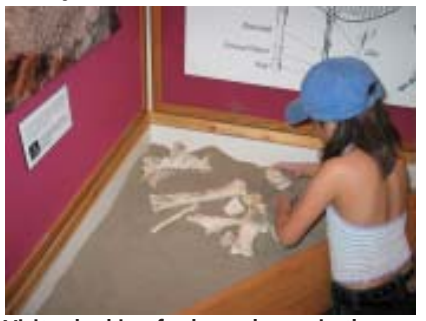
Visitor looking for horse bones in the sand box at the monument visitor center