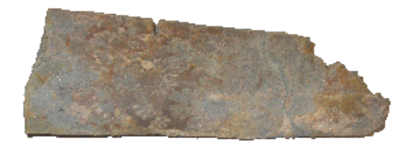
Baculites rex from the Upper Cretaceous Point Loma Formation of Cabrillo National Monument

Greg McDonald Geologic Resources Division National Park Service