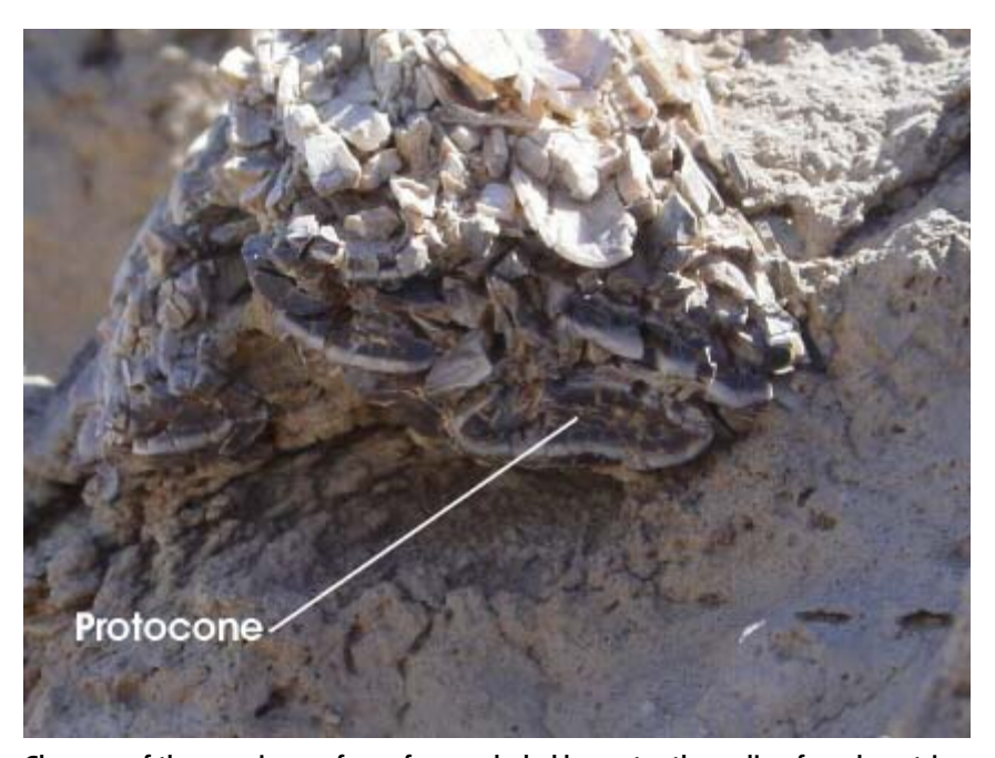
Close-up of the wearing surface of an exploded horse tooth eroding from lacustrine deposits in the Pinto Basin. The length and shape of the protocone (indicated) of this tooth suggest that this is probably a Pleistocene horse; earlier Pliocene horses has shorter, more rounded protocones.