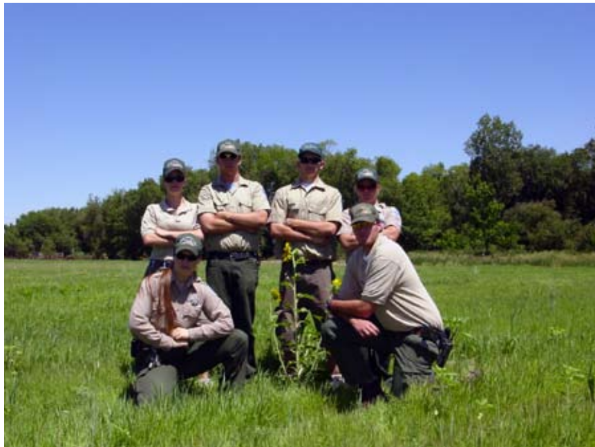
a little photo we call Sunflower S.W.A.T.

For a full description of the above action, you'll have to send me some of your photos as payment.