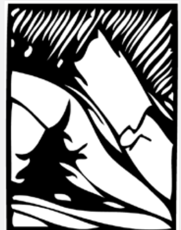
Sierra Slopes by Everett Ruess

a bold teenage adventurer, artist, and writer