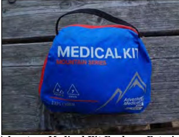
Adventure Medical Kit Explorer Exterior

As an EMT I want to carry a small EMS pack and related supplies, so besides the epi-pens, SAM splint and CPR mask I also carry an Adventure Medical Kit Explorer kit. It is lightweight and well stocked and organized for the typical medical aid I may encounter while on foot or away from my vehicle. They only change I made to the kit was adding an emergency blanket, coban-type wrap tape, a SWAT-T tourniquet, a Sharpe marker, a space pen, and Marin County EMS patient assessment forms.