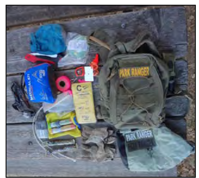
Contents of my patrol pack