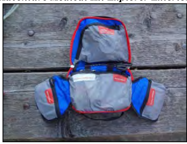
Adventure Medical Kit Explorer Interior

I feel my current patrol pack set up is nearly perfect and the best I've had in my 22-year career as a park ranger. I want to carry the supplies my experience tells me I might need, but in a lightweight, compact pack. I also wanted the pack to be flexible, with room for additional gear, as needed. The Mil-Spec Monkey Adapt Pack is the best patrol pack that I have ever used and I highly recommend it. Besides Mil-Spec Monkey, there are many other great patrol pack manufacturers including: Tactical Tailor, First Spear, 5.11 Tactical, LA Police Gear, and Camelbak. So there are now many choices to choose from and there is a patrol pack out there that will meet your needs.