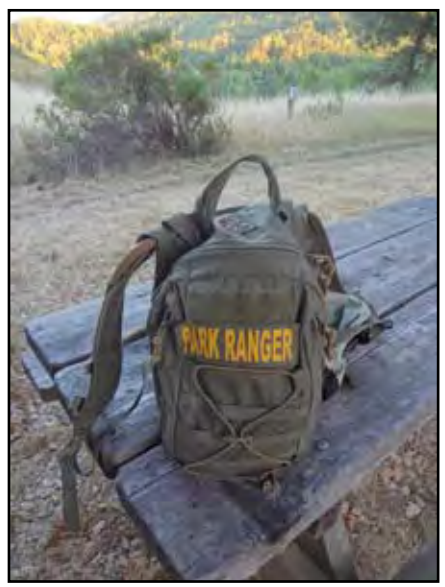
Front of the MSM Adapt Pack

For this article, I'm going to do something different, a look inside my patrol pack and a gear review. Perhaps I should have called it "Inside the Ranger's Pack." As a park ranger for the Marin Municipal Water District I spend a good percentage of my patrol time on foot. Many of locations are only accessible on foot, sometime an hour or more from the nearest vehicle access, so having a good patrol pack is, in my opinion, essential. Over the years I've used a variety of backpacks for my patrol packs, for the past year I've been using the Adapt Pack which is from Mil-Spec Monkey in collaboration with Tactical Tailor. I picked the Ranger Green color for the pack, although the Foliage Green or Coyote Tan would also work well for a park ranger patrol pack.