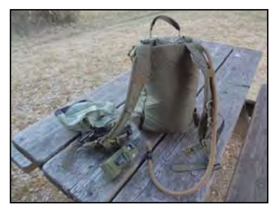
Rear of the MSM Adapt Pack

I found the Adapt Pack to be the perfect patrol pack, it's mid-sized with a cargo capacity of about 1179 cu. in. and lightweight at 1.75 pounds. It has a sleeve for a hydration system, a main compartment with two pockets, a front compartment, a front loop Velcro ID panel, and front shock cord rig for secure items like a jacket. I like the pack so much I often use it off-duty for hiking or mountain biking.