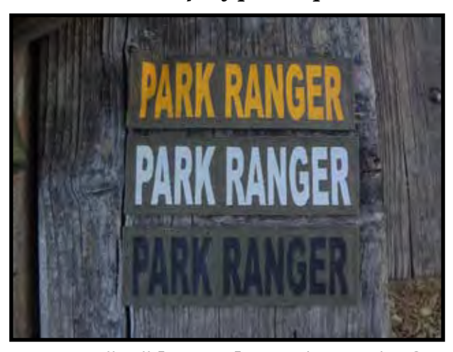
Copquest 2"x6" loop velcro PARK RANGER ID panel on Ranger Green backing with Gold, Reflective White and Tactical Black lettering. A flexible and mission specific way to ID your pack.

As an EMT I want to carry a small EMS pack and related supplies, so besides the epi-pens, SAM splint and CPR mask I also carry an Adventure Medical Kit Explorer kit. It is lightweight and well stocked and organized for the typical medical aid I may encounter while on foot or away from my vehicle. They only change I made to the kit was adding an emergency blanket, coban-type wrap tape, a SWAT-T tourniquet, a Sharpe marker, a space pen, and Marin County EMS patient assessment forms.