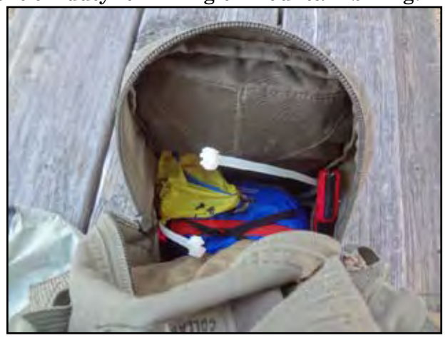
Inside the main compartment of the MSM Adapt Pack

I found the Adapt Pack to be the perfect patrol pack, it's mid-sized with a cargo capacity of about 1179 cu. in. and lightweight at 1.75 pounds. It has a sleeve for a hydration system, a main compartment with two pockets, a front compartment, a front loop Velcro ID panel, and front shock cord rig for secure items like a jacket. I like the pack so much I often use it off-duty for hiking or mountain biking.