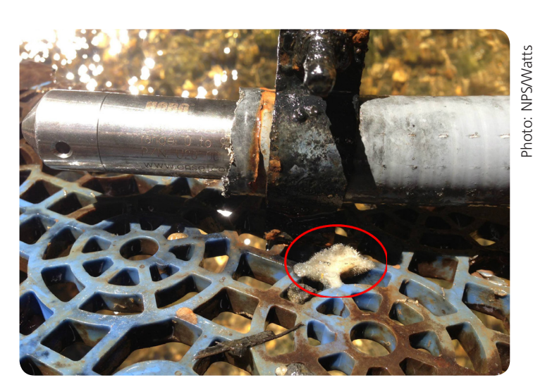
A freshwater sponge (circled in red) was found growing next to a continuous water logger in Rock Creek near Dumbarton Oaks.

Syphax discovered one in the northern portion of Rock Creek that was later identified as Eunapius fragilis .