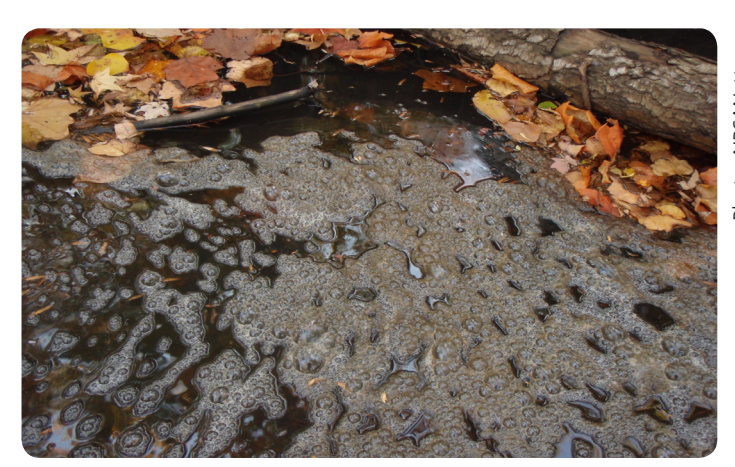
Autumn foam on Still Creek in NACE.

Foam can also be caused by human factors such as sewage, cleaning products (detergents), petroleum pollution, agriculture, and other organic discharges. How can you determine if the foam is likely from natural or man-made sources? It is possible to make an educated guess in the field without expensive testing. Natural foam has a more natural, earthy or fishy smell, while man-made products may have a "sweet or perfume smell." The appearance of foam is usually opaque,