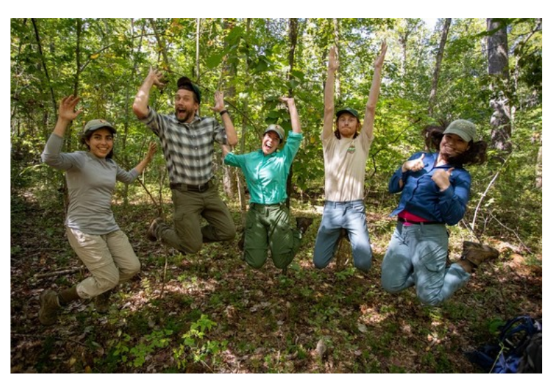
Photo: Seedling recovery, seen here at Catoctin, is an early step toward rebuilding forest regeneration capacity.

Tree seedlings and small saplings are still in short supply in National Capital Region national parks. The latest look at forest regeneration capacity based on monitoring data from 2022 is now available. <u>Read more.</u>