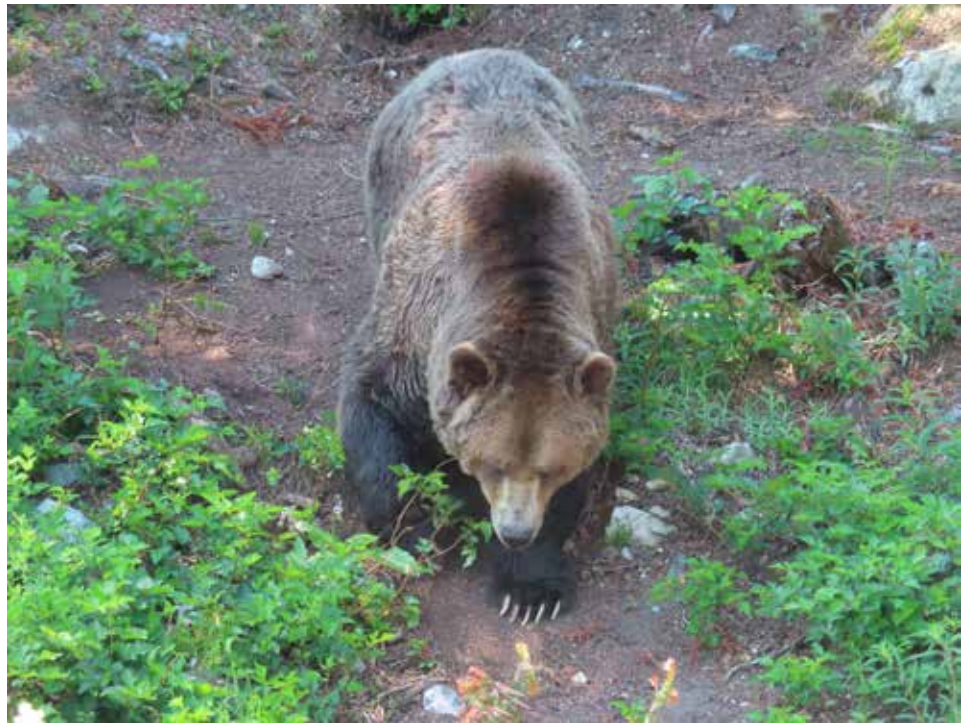
Male grizzly in the BC Coast Range. Note claws—useful for scooping vegetation in riparian areas and opening trees/logs for forage.

We believe returning these magnificent creatures to their place at the apex of an intact North Cascades ecosystem can be accomplished with few bear/human conflicts and to the benefit of bears, humans, and the wilderness—but there are no shortcuts. Grizzly restoration should begin with the establishment of undisturbed corridors that would allow grizzlies to expand their range into the North Cascades from nearby existing populations in Canada and Montana. Protection and enhancement of habitat with-