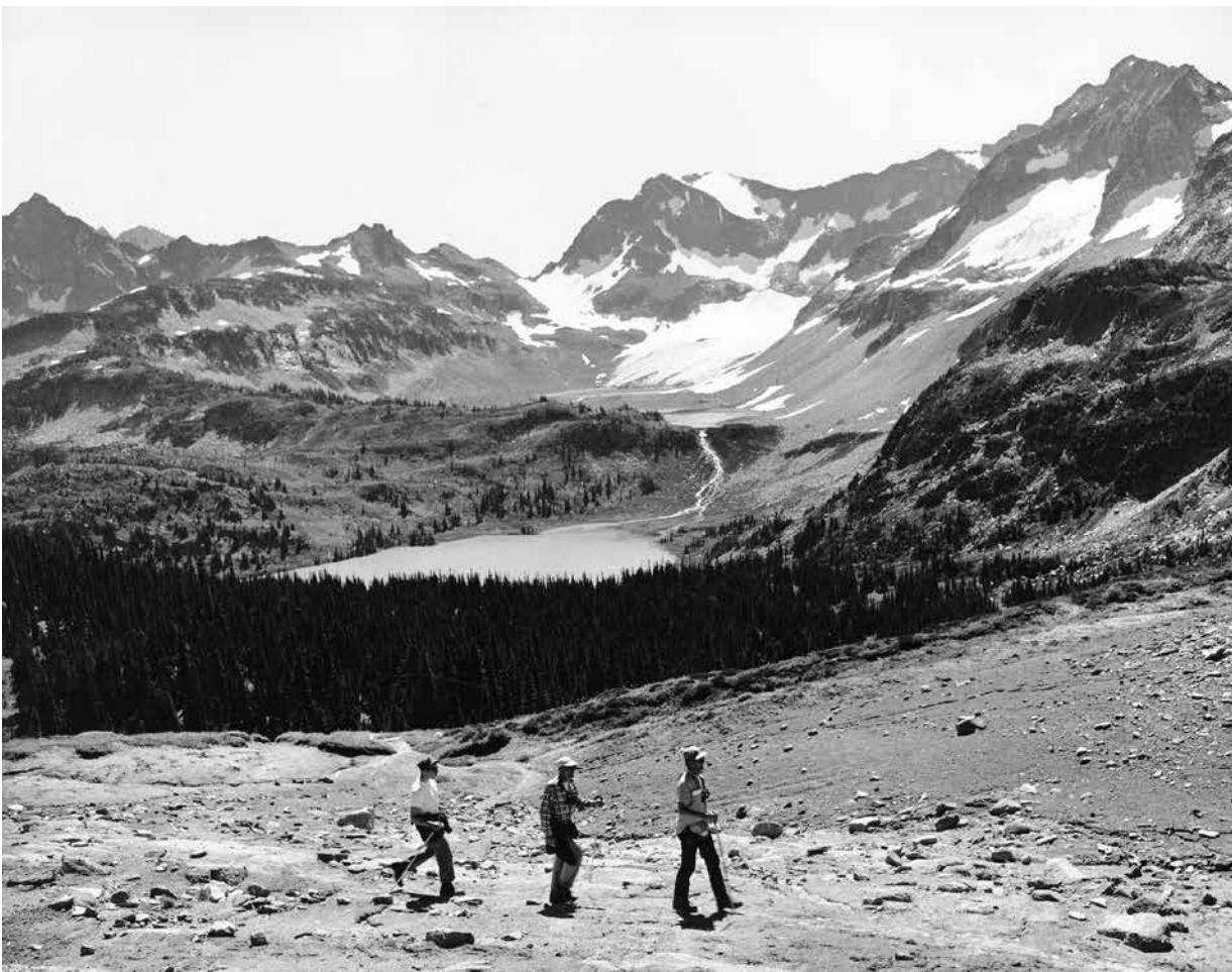
Three hikers in the subalpine meadows above Lyman Lake, with Lyman Glacier, Red Mountain, and Chiwawa Mountain in the background.

Non-Profit Organization U.S. POSTAGE PAID SEATTLE, WA PERMIT No. 8602