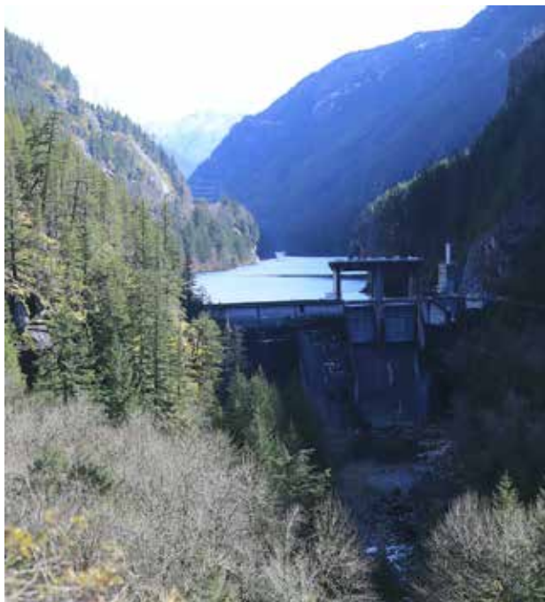
Gorge Dam’s penstock tunnel de-waters the Skagit River for 2 miles.

It was then revealed that there was no written agreement or list of agreements made by the Partners Table. The FLA represents SCL’s perspective on what it would do to meet the requirements of FERC to obtain a new license but would not include all the elements of a Settlement Agreement among the license participants. The FLA was