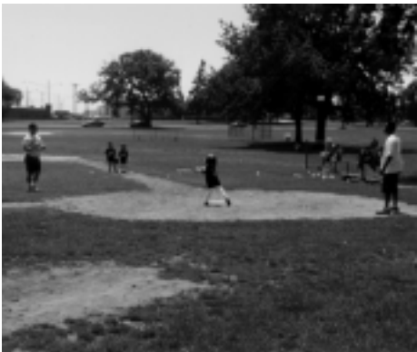
TOP: Carroll Park, "Mount Clare" Estate