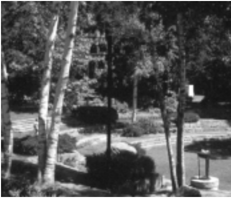
Camden Amphitheater, circa 1960s Fletcher Steele, Landscape Architect

most closely associated with the project are seeking to understand the evolution of the site and are striving to develop a consistent philosophical approach among the choices articulated in the Secretary of the Interior's Standards . Also under consideration will be the advantages and disadvantages of proposals that have been put forth by history enthusiasts to add elements "typical of the period" for a Georgian estate.