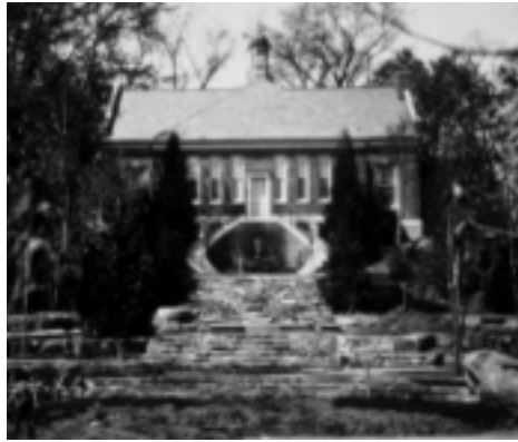
Camden Library and Amphitheater, historic view

Another important part of the Historic Landscape Initiative's contribution included a discussion of the application of the Secretary of the Interior's Standards and how they should be used as guidance for the restoration of this important work. Steele himself recognized that trees could outlive their original design intent. To illustrate this, Birnbaum referenced Steele's essay, "Trees are a Bother" from Gardens and People (1964): "If a tree will not fulfill some useful purpose or