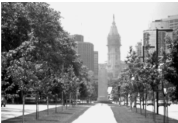
Rehabilitated Benjamin Franklin Parkway