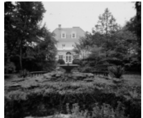
TOP: The Gill House, situated on bluffs overlooking Ohio River, circa 1904.