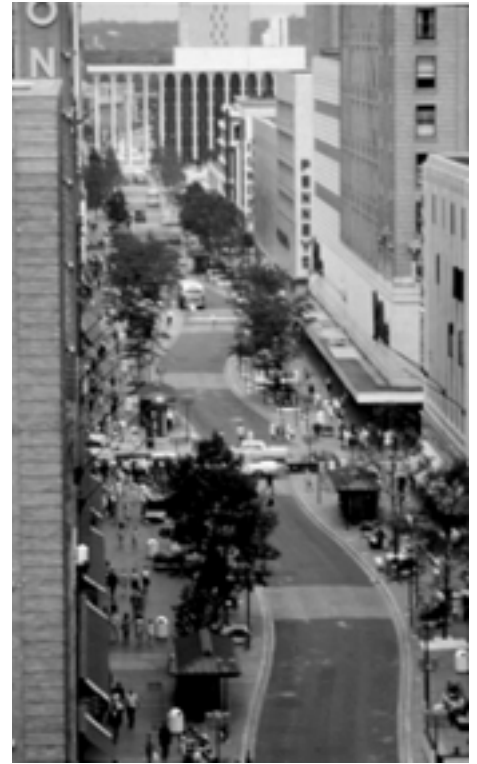
Nicollet Mall, Minneapolis, Minnesota