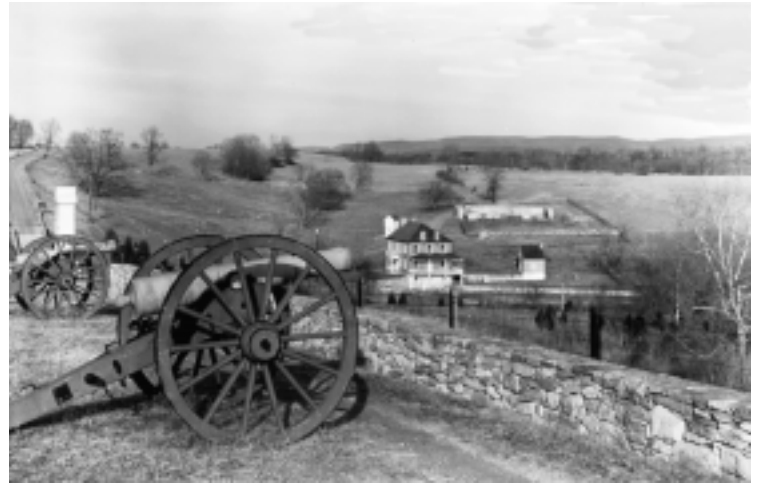
Antietam National Battlefield CLR is underway

The CLR guide is a valuable resource for anyone involved with managing landscapes.