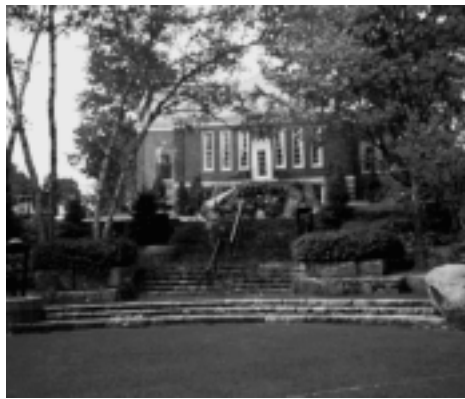
Camden Library and Amphitheater, today

The Camden Amphitheater event was an opportunity to educate the public, and proved to be both informative and well received. Above all, it was an excellent example of the type of public education showcasing collaboration between federal, state and local government – working together towards cultural landscape preservation. In order to move ahead on these