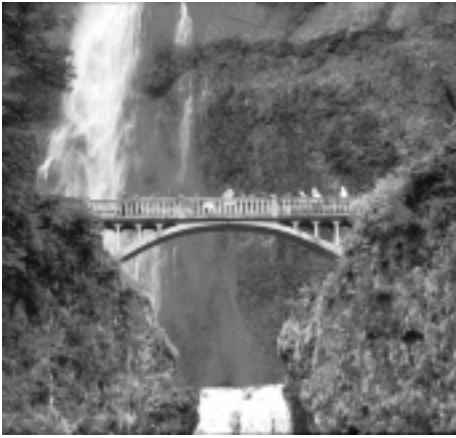
Historic Columbia River Gorge