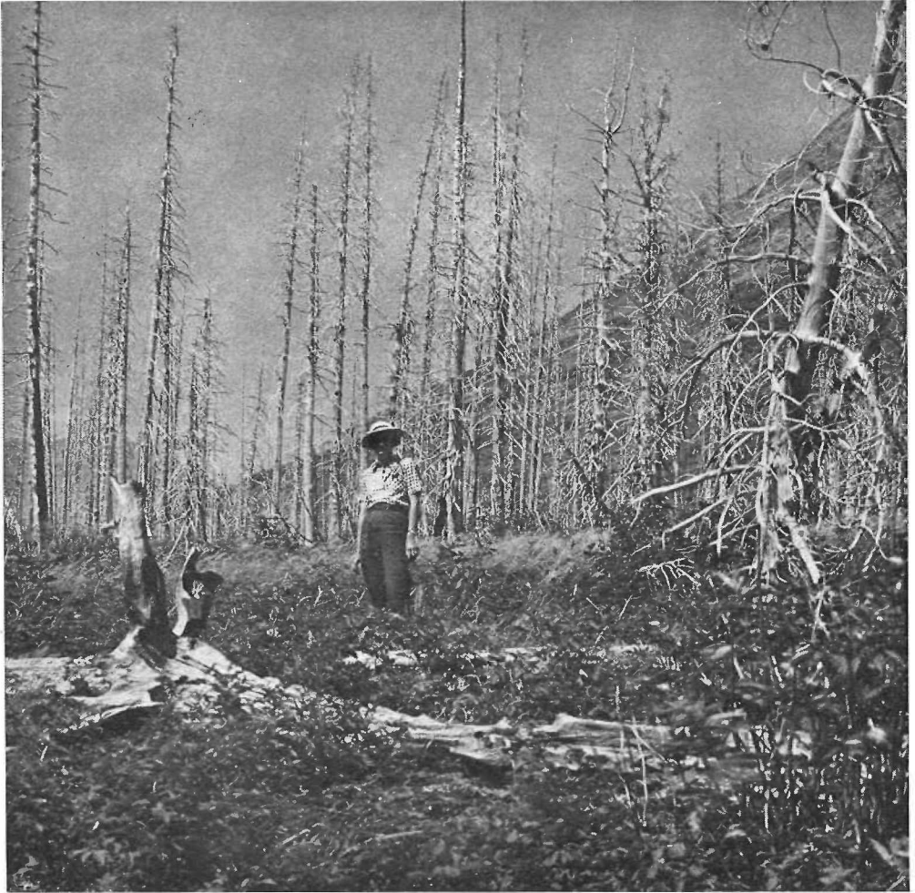
National Parks Association

Seventy percent of forest fires in our country are man-caused. The area so burned each year is equal to the size of Indiana. This destruction could be prevented if incendiarism and all carelessness were wiped out. The above picture shows a burned forest in Glacier National Park. This forest is now useless to man and to most species of wildlife. Let us remember that the greatest loss is caused by human carelessness such as failure to extinguish camp fires, and dropping lighted cigarettes or matches in dry leaves and needles. For the sake of national welfare, let us help keep our forests green this summer by extinguishing camp fires, by dropping no lighted matches, cigarettes, cigars or pipe duff along wooded trails or roads, and by informing others of the need for taking these same precautions.