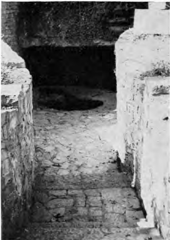
The Sinking Spring

cut pink granite and Tennessee marble, was constructed by the Lincoln Farm Association in the years 1909-11 through funds raised by popular subscription. Over 100,000 citizens, many of them school children, contributed to this fund. The cornerstone of the building was laid by President Theodore Roosevelt on February 12, 1909, the one hundredth anniversary of Lincoln's birth. The chief address at the dedication of the building on November 9, 1911, was delivered by President Taft.