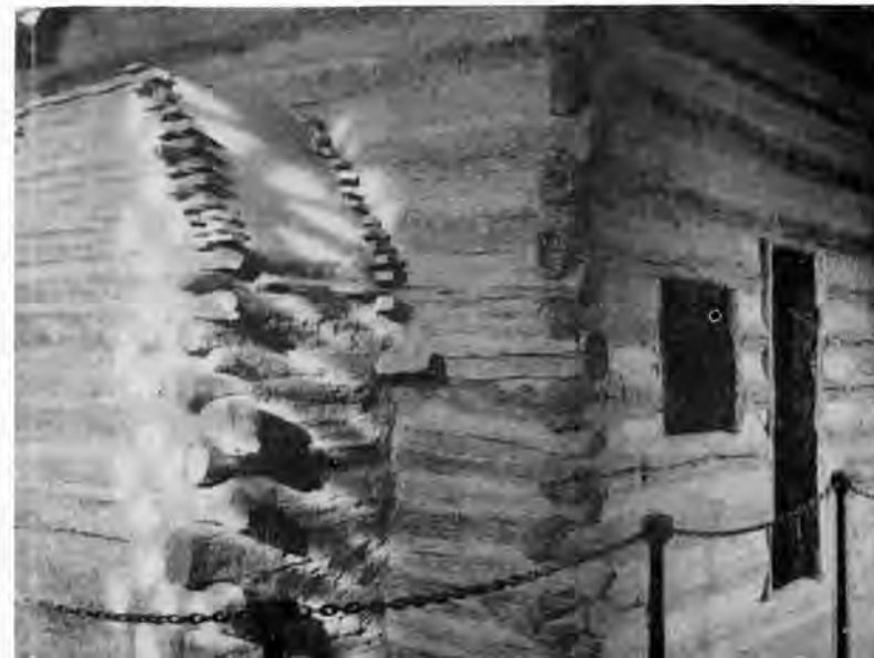
Traditional Lincoln birthplace cabin showing door and window

The Memorial Building, designed by John Russell Pope and built of Connecti-