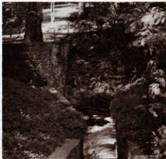
THE SINKING SPRING