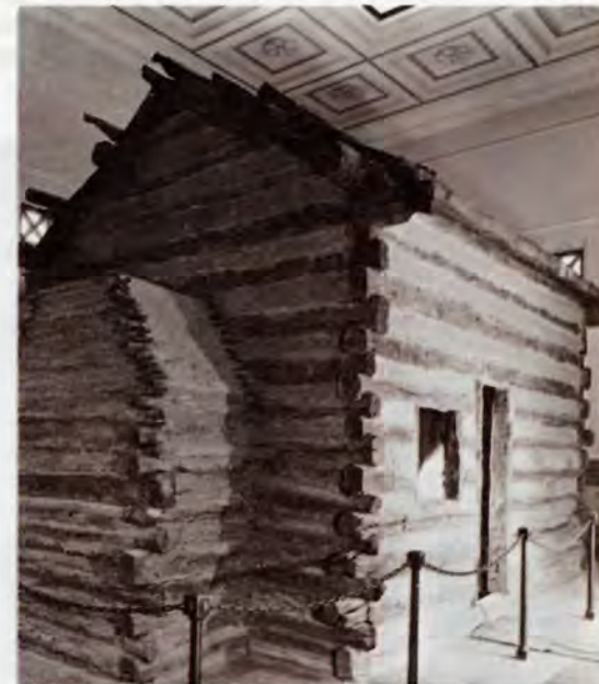
THE TRADITIONAL BIRTHPLACE CABIN

Designed by John Russell Pope, the building was built of Connecticut pink granite and Tennessee marble by the Association between 1909 and 1911 through funds raised by popular subscription. More than 100,000 citizens, many of them school children, contributed to this fund.