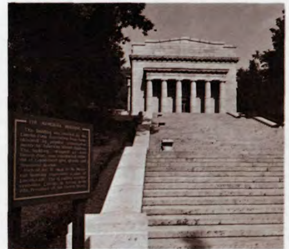
THE LINCOLN MEMORIAL BUILDING