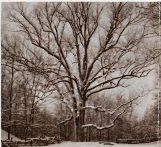
THE BOUNDARY OAK