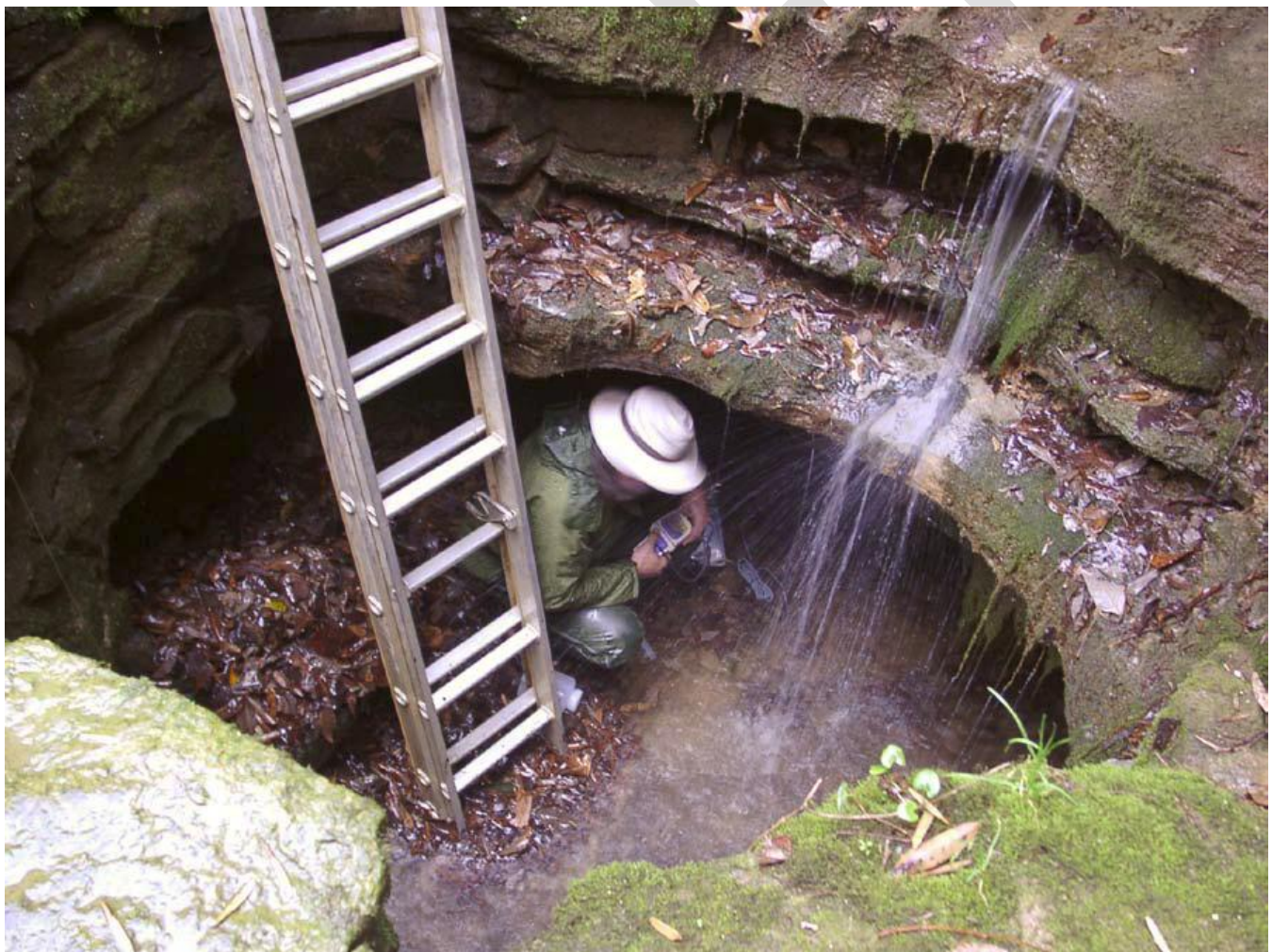
Sinking Spring on the Abraham Lincoln Birthplace Unit.

Sinking spring is likely a high-level spring type. The shallow flow paths inherent in this type of spring are highly connected with surface runoff and therefore have rapid responses to changes in precipitation and contamination. Potential issues with the spring include adjacent agriculture runoff, highway runoff, septic systems, litter and coins from visitors, and increased development that could deplete water resources and lead to a lower groundwater table (Hutchison et al. 2011; Thornberry-Ehrlich 2010).