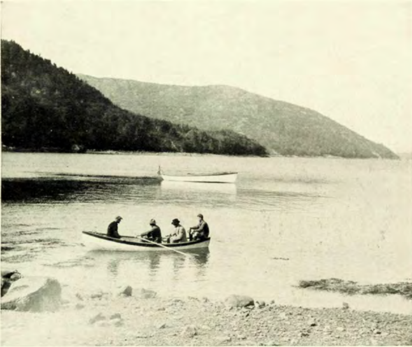
VALLEY COVE ON SOMES SOUND FIORD