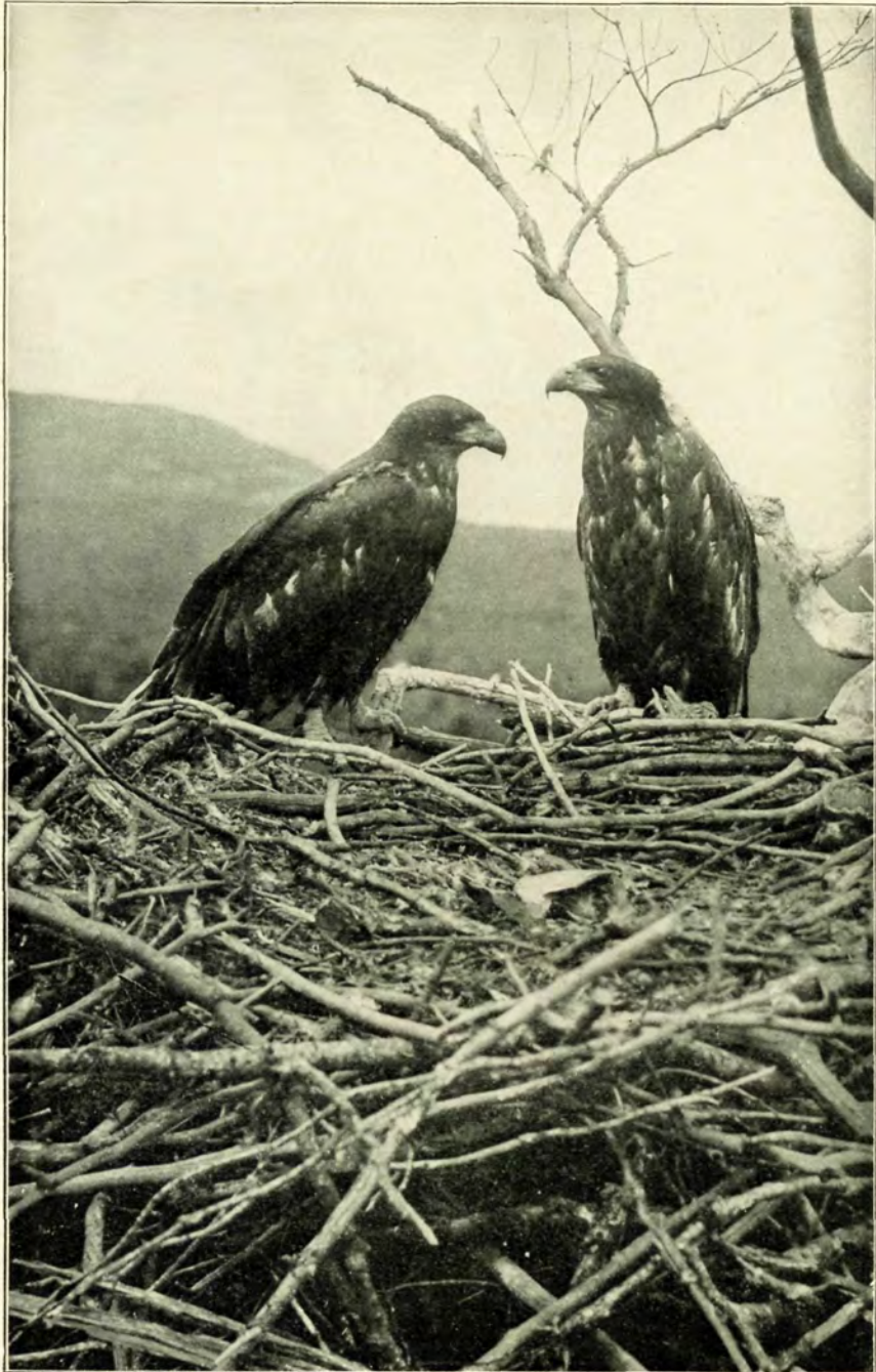
YOUNG BALD EAGLES