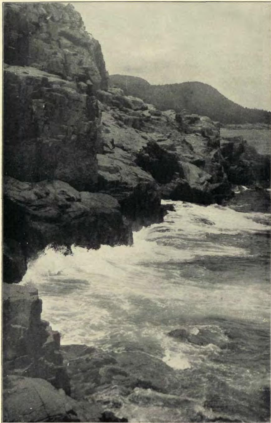
THE OCEAN FRONT AT OTTER CLIFF