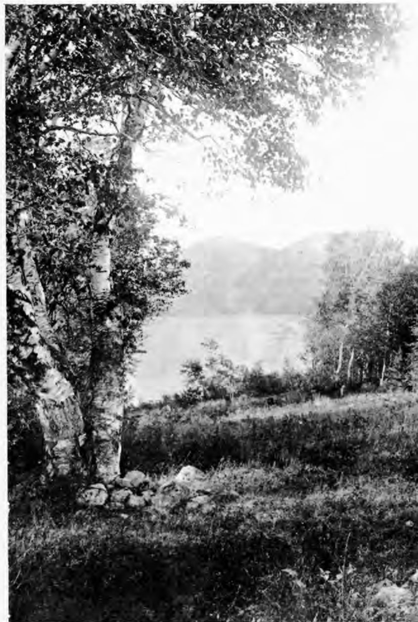
The quiet waters of beautiful Jordan Pond in sharp contrast to the pounding surf a little distance away.

Boat trips can also be arranged at the public boat landings in Seal Harbor, Northeast Harbor, and Southwest Harbor.