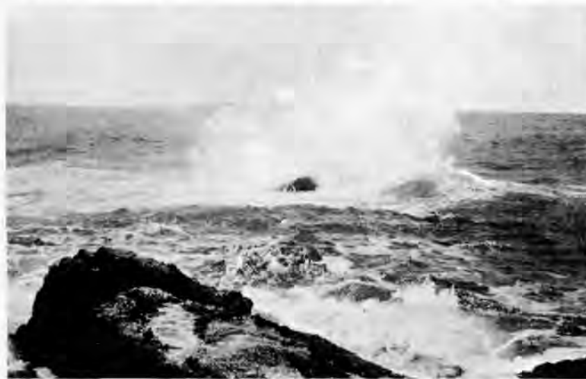
The surf as it must have looked when Champlain discovered Mount Desert Island in 1604.

It was from the impulse of that early summer life that the movement for public reservations and the national park arose, springing from memory of its pleasantness and the desire to preserve in largest measure possible the