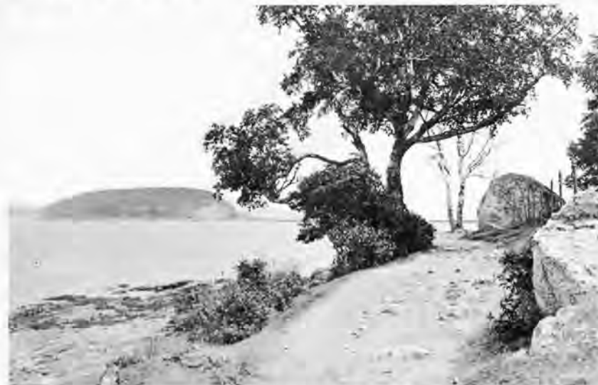
Many trails follow the shore.

The visitor is encouraged to avail himself of the free nature guide service which is maintained in Acadia National Park by the Office of National Parks, Buildings, and Reservations. The park naturalist, whose duty it is to acquaint the visiting public with the geology and the plant and animal life within this unique sanctuary, conducts a diversified program whereby the visitor may accompany him on a leisurely walk around one of the many lovely lakes, follow him on a climb to some mountain summit, journey with him over pleasant ocean waters to Islesford on the Little Cranberry Island, and listen to his lectures, which are given three times a week at the