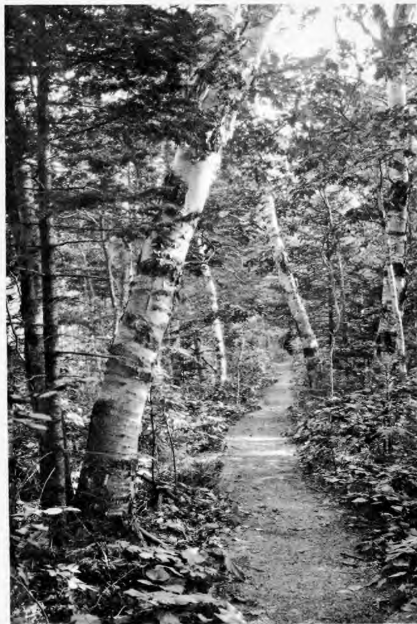
Plant life in great variety attracts hikers.