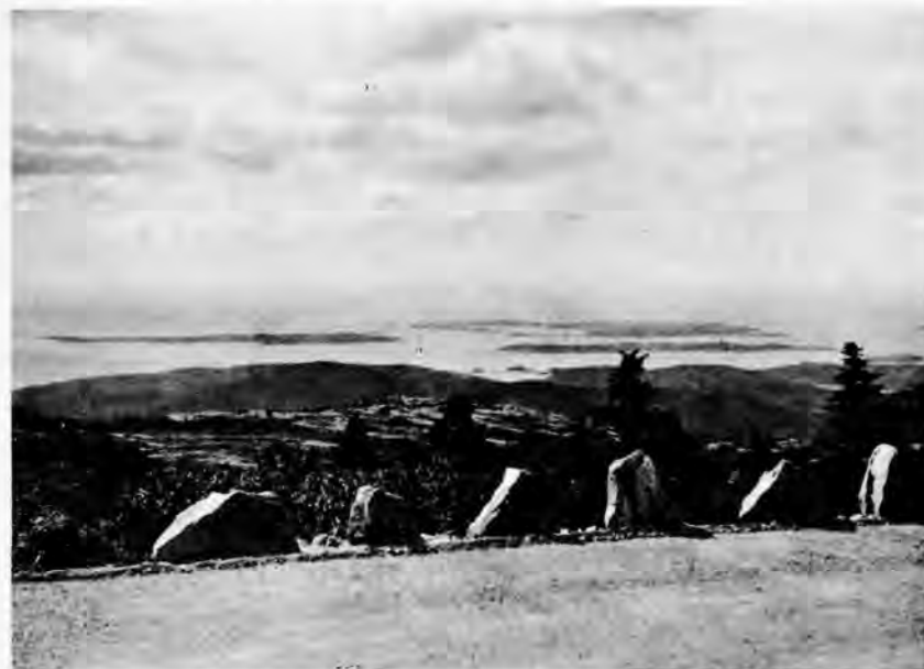
Looking toward the sea from the Cadillac Mountain Road.

De Monts, sailing in the spring of 1604, founded his first colony on an island in the tidal mouth of a river at the western entrance to the Bay of Fundy—"Baie Francoise" he named it, though the Portuguese name "Bahia Funda," Deep Bay, in the end prevailed—which two centuries later, in memory of it, was selected to be the commencement of our national boundary. While he was at work on this he sent Champlain in an open vessel with a dozen sailors to explore the western coast. A single, long day's sail with a favoring wind brought him at nightfall into French-