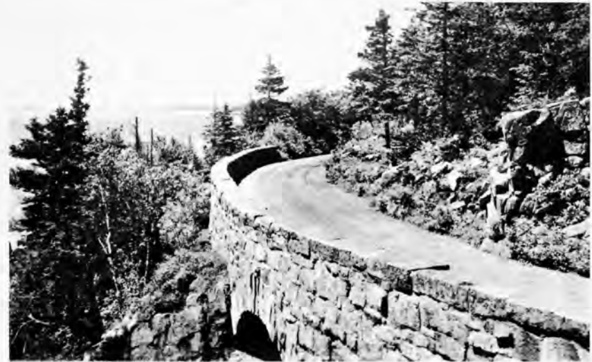
Driveways have been carefully located to preserve landscape beauty.

The railroad terminus for the park and Mount Desert Island resorts is Ellsworth, Maine, on the line of the Maine Central Railroad. Comfortable