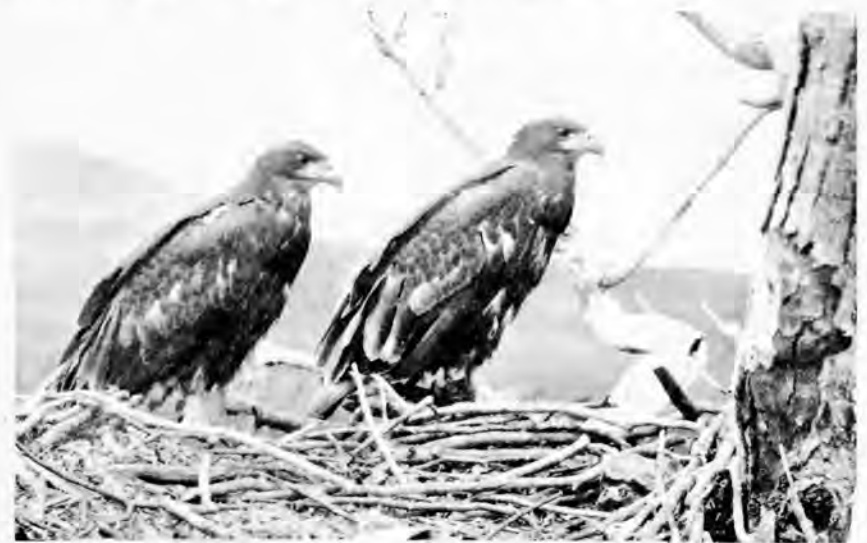
Young bald eagles.

features of the park and its environment. By means of it a marine biological laboratory has been established on the shore, material has been gathered for a book upon the wild flowers of the park and wild gardens for their exhibition started, and entomological collections and studies in the bird life and geology of the region have been made. The park itself is a living natural-history museum, a geological and historic area lending itself remarkably to the nature guide and lecture service which is rapidly becoming so valuable a feature in our national parks.