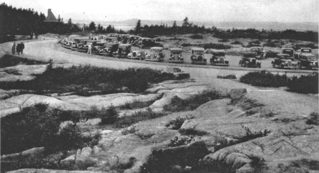
PARKING AREA ON TOP OF CADILLAC MOUNTAIN

urged to avail themselves of this service, for by no other means can so complete an understanding of the park be had.