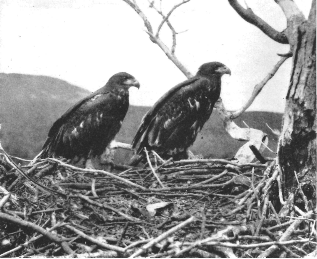
YOUNG BALD EAGLES