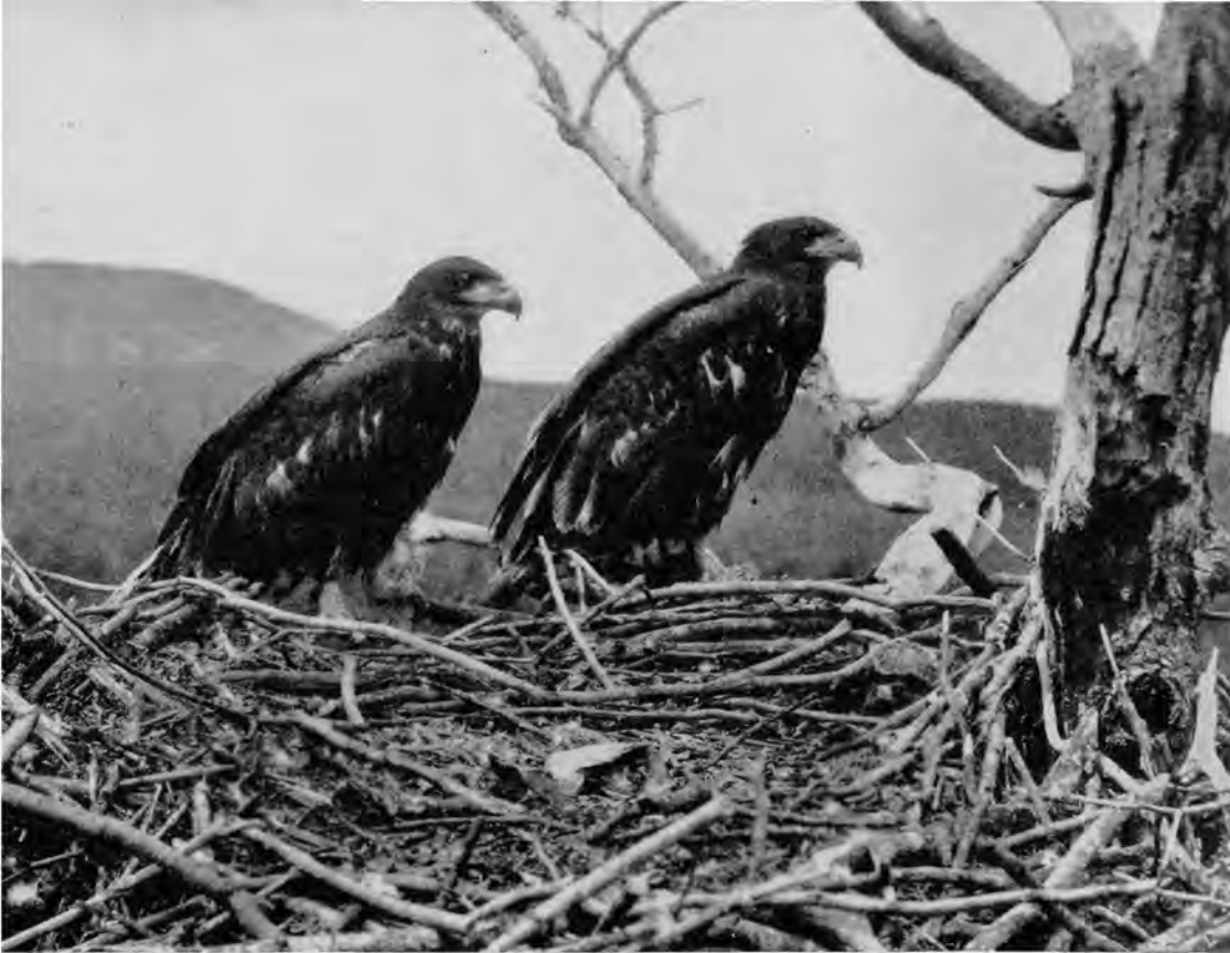
YOUNG BALD EAGLES