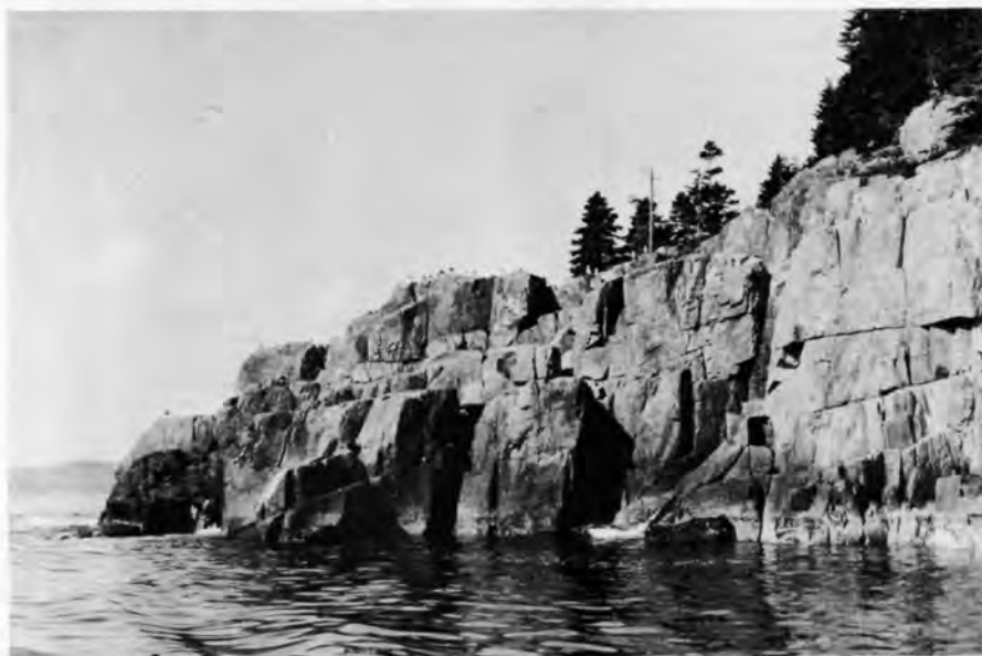
GULLS ARE NUMEROUS ALONG THE PARK'S ROCKY COAST

SALE OF ARTICLES. — No person, except those who are especially authorized to do so, shall offer for sale any articles or commodities. The soliciting of contributions by any method is prohibited.