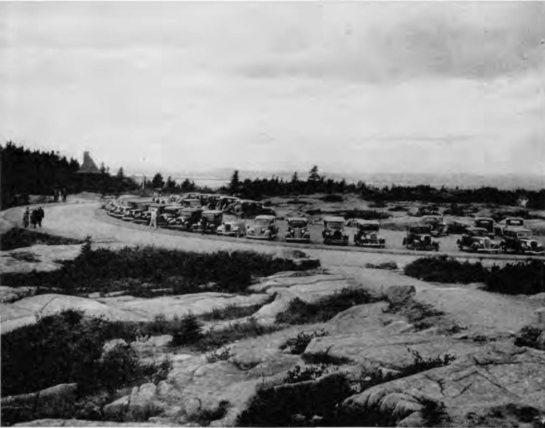
PARKING AREA ON TOP OF CADILLAC MOUNTAIN

urged to avail themselves of this service, for by no other means can so complete an understanding of the park be had.