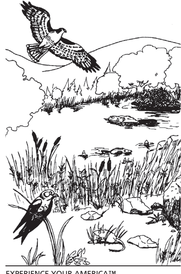
EXPERIENCE YOUR AMERICA™