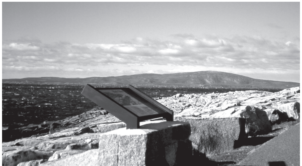
Schoodic Point offers views of Mount Desert Island.

Although overnight camping is not permitted in the Schoodic section of Acadia National Park, private campgrounds are located nearby. For current information, contact the Schoodic Peninsula Chamber of Commerce at 207-963-7658 or P.O. Box 381, Winter Harbor, Maine, 04693, or visit www.acadia-schoodic.org . For park information, visit www.nps.gov/acad .