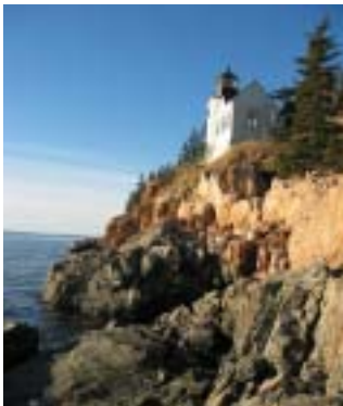
Bass Harbor Head Lighthouse.

For the protection of park resources, a number of areas in the park are closed from midnight until one hour before sunrise. These areas include: • Cadillac Mountain Summit • Bass Harbor Head Lighthouse parking area (The road is closed to motor homes.)