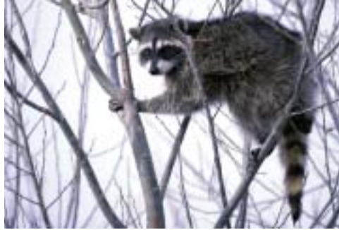
Feeding raccoons and other wildlife can create beggar animals that lose their fear of humans, endangering their lives and ours. Please secure your food, dispose of trash properly, and do not feed wild animals.

Don't forget: Acadia National Park is their home. Let's do what we can to make it a safe place for them to live.