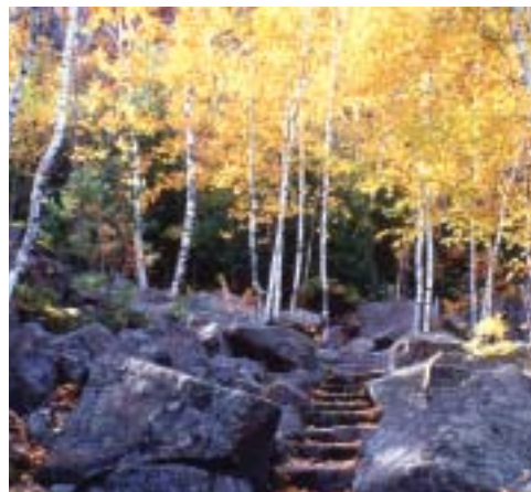
Fall colors on the Dorr Trail.

Local communities offer boat trips, whale watching, canoe rentals, and ocean kayaking trips. For more information, contact local chambers of commerce.