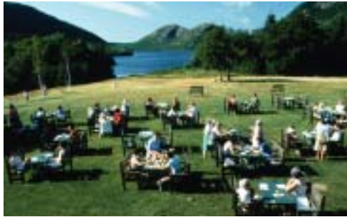
Enjoy tea and popovers on the lawn at the Jordan Pond House with its spectacular views of Jordan Pond and the Bubbles.

Two park concessions offer services to visitors within Acadia National Park. Acadia Corporation operates gift shops at Cadillac Mountain, Thunder Hole, and Jordan Pond. Visit the Jordan Pond House for traditional tea and popovers, or a full lunch or dinner. The shops and restaurant are open until October 24, 2004. For reservations, contact the Jordan Pond House at 207-276-3316.