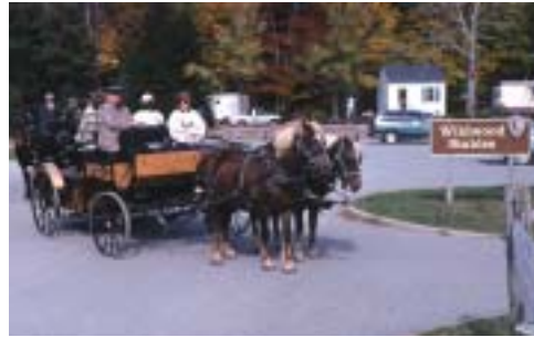
Explore the scenic carriage roads of Acadia National Park on a horse-drawn carriage tour.

Wildwood Stables , located one mile southeast of Jordan Pond, features horse-drawn carriage tours along Acadia's historic carriage roads. Enjoy scenic vistas and cool forests on your narrated tour. Private tours and stabling for your personal horse are also available. Tours available until October 11. For information, contact Wildwood Stables at 207-276-3622.