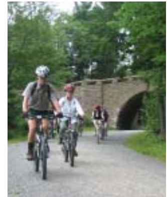
"Riding the Roads" with a ranger near Eagle Lake.

Each program is offered through September. See pages 4-6 for program schedule. Don't miss this chance to explore the park with a ranger!