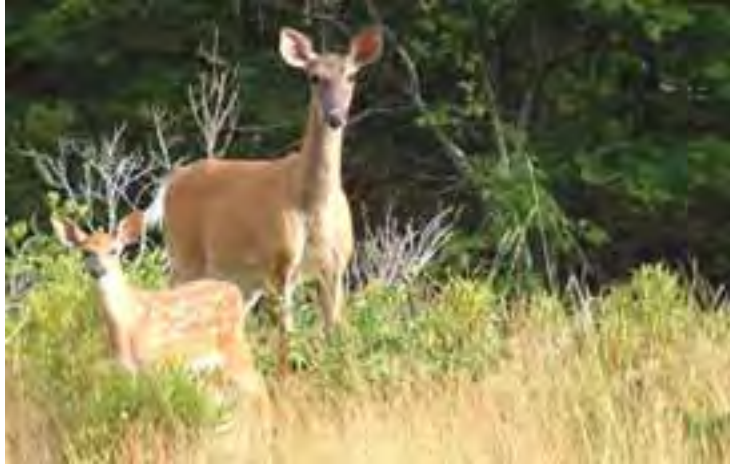
Fox, deer, beaver, porcupine, and other animals are not uncommon along roadsides on the island. Please drive carefully.

Don't forget: Acadia National Park is home to a variety of wildlife. Let's do our part to make the park a safe place for them to live.