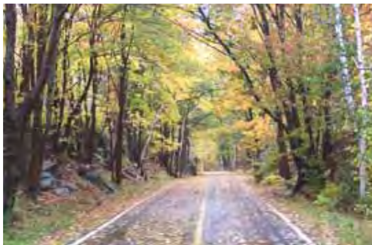
Enjoy fall colors from park roads.