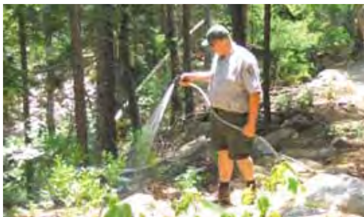
Areas requiring revegetation are planted with native species.

So what is the park doing to protect its native plants and animals? Is it an impossible mission? We don't think so, but ensuring the health and well-being of parks requires hard work. Staff must determine whether a particular exotic poses a serious threat to native resources and if control is feasible, identify and monitor areas where non-native plants grow, and decide which treatments will be effective.