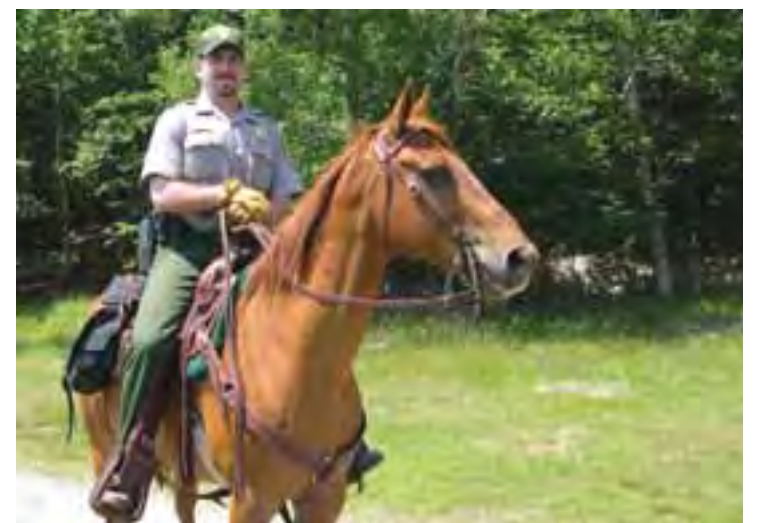
Max on the job.

Thanks to the generous support of Friends of Acadia, the Mount Desert Island chapter of the Equine Affairs Association, and many other local residents, Max can be seen out on patrol four to five days a week. If you happen across Max during your adventures in the park, be sure to say hello and give him plenty of room to pass.