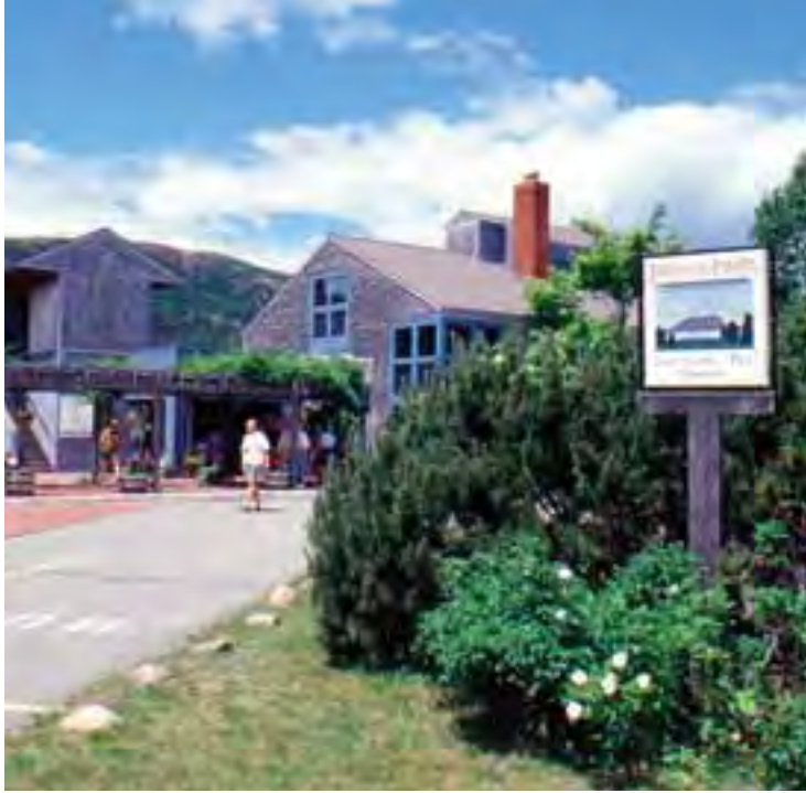
The Jordan Pond House offers tea and popovers, as well as a full lunch and dinner, in a spectacular setting.

If you'd like to sit back and relax as you learn about Acadia National Park and Mount Desert Island, a narrated bus tour might be just the activity for you. Beginning and ending in Bar Harbor, these tours explore the natural and cultural history of the park and surrounding area. Stops include many popular park sights, including Cadillac Mountain. National Park Tours (207-288-0300) offers 2½-hour tours. Oli's Trolley (207-288-9899) offers both 1-hour and 2½-hour tours. Advance reservations recommended.