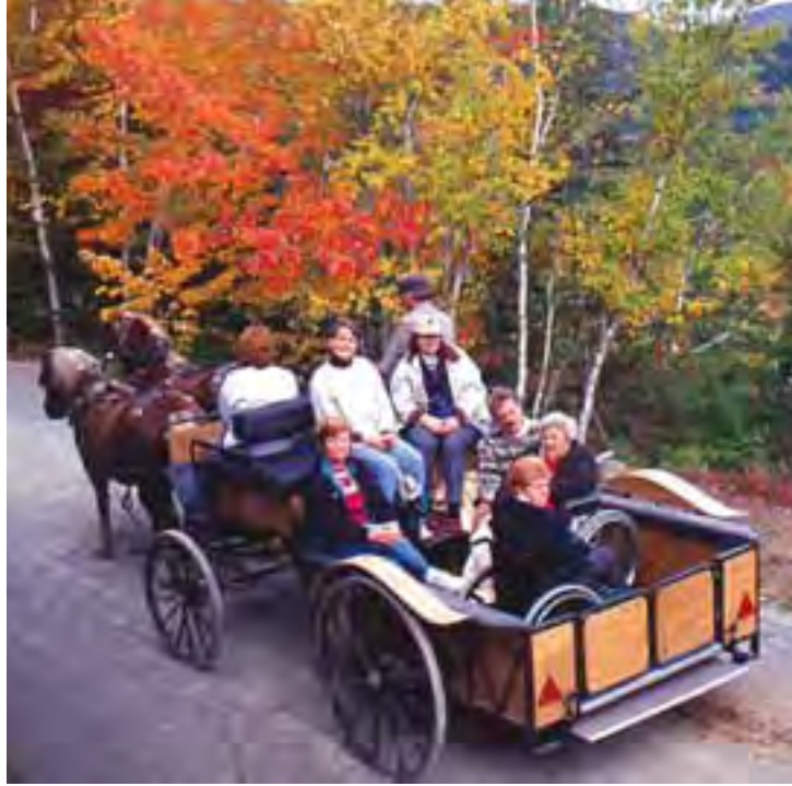
Explore the scenic carriage roads of Acadia National Park on a horse-drawn carriage tour.