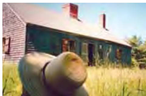
The Carroll Homestead.