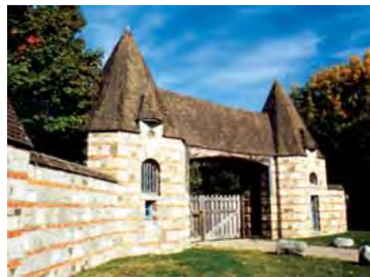
The gate at the Brown Mountain Gatehouse.

Fare-free Island Explorer buses operate throughout Mount Desert Island, linking the park to neighboring village centers, through October 10, 2005. By parking your car and riding these propane-powered buses, you can help reduce traffic congestion, parking, and air pollution problems on the island. Pick up a schedule at the visitor center or Bar Harbor Village Green. You can also flag down the bus anywhere it is safe to stop along its route.