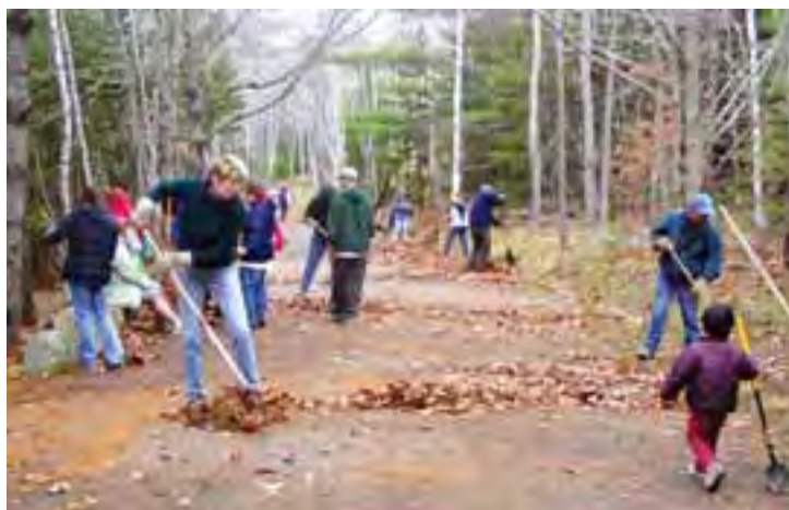
Volunteers clean leaves from drainages on a carriage road.

For active visitors, the historic carriage road and hiking trail systems beckon. Built by John D. Rockefeller Jr. in the early 20th century, the carriage roads continue to offer the same automobile-free experience envisioned at their inception. With carriage roads winding throughout the east side of the island, you can take a short, leisurely ride or link segments to create a day-long bicycling adventure. (Note: Bicycles are not permitted on hiking trails or privately owned carriage roads.) Over 120 miles of hiking trails, many created by the island's village improvement societies in the late 1800s and early 1900s, crisscross the island. You can choose between well-traveled routes or more isolated trails that provide solitude.