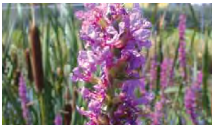
Purple loosestrife is the focus of an extensive control effort in Acadia National Park.

You can help turn the fight against exotics into a "mission possible." Contact your local cooperative extension to learn about destructive plants in your area. Don't buy invasive plants from nurseries; garden with native plants instead. Watch your step while exploring natural areas and stay on designated trails to avoid crushing fragile plants. Clean and dry your boat and gear after removing it from lakes with invasive species. Don't release pets that are no longer wanted; talk to your veterinarian to find them a new home. Learn more about our country's rich native plant and animal life so you can help ensure that your children and grandchildren can enjoy it, too.