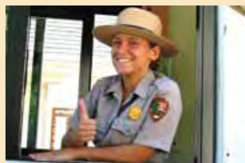
Your entrance fees help support the park and the fare-free Island Explorer buses.