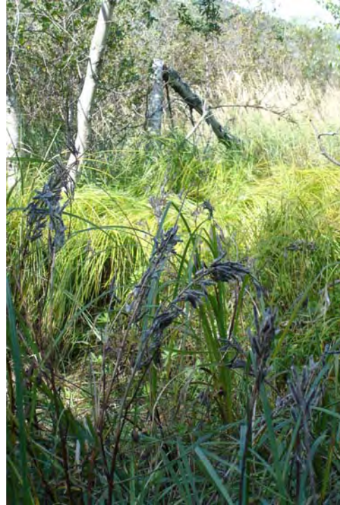
Lupine seed heads in dense sedge growth in wetland.