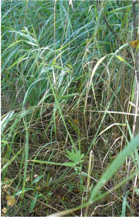
Lupine seedling at base of dense graminoids.