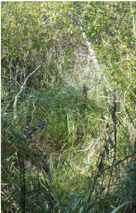
Lupine seed heads in dense graminoid growth in Great Meadow wetland.