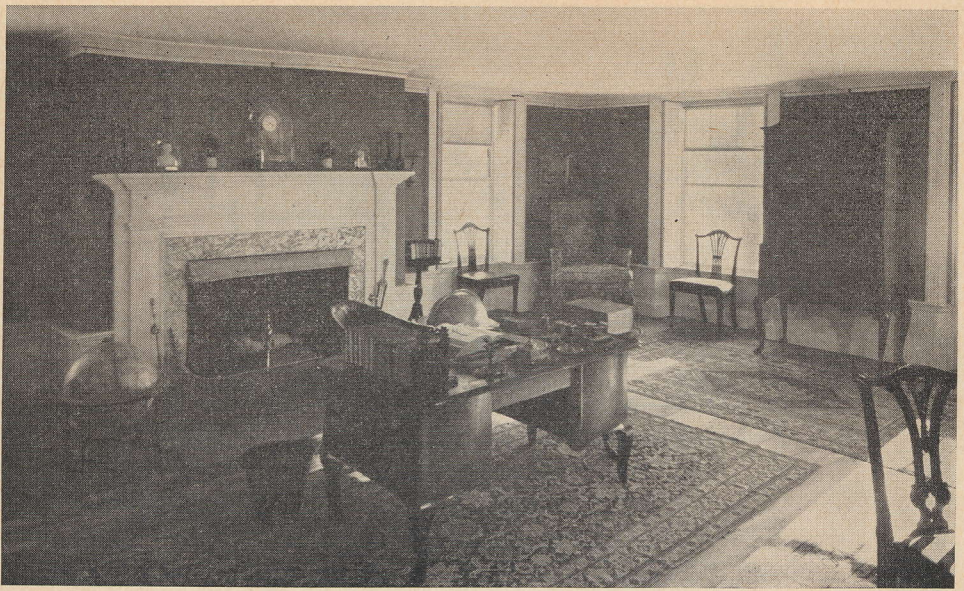
JOHN ADAMS STUDY. The desk was used by four generations of the family. The celestial and terrestrial globes were used by John Quincy Adams. The chair in the corner is where John Adams died.

until 1788. Throughout these trying times there was no one who played a more important part than John Adams in fighting for independence and foreign recognition. Together with Franklin and Jefferson, he selected E Pluribus Unum (One Out of Many) for the motto on the obverse of the seal of the United States. In the new government under the Constitution he was elected Vice President and during both of Washington's terms presided over the Senate of the United States. Elected to the Presidency in 1796, Adams served with great ability and, fortunately for the country, despite the clamour of many of the leaders of his own party, prevented a war with France. In 1801, he retired to his home in Quincy, but never lost his keen interest in public questions as is attested by his voluminous correspondence. He lived to see his son elected to the Presidency, and passed away on July 4, 1826, the same day that saw the death of Thomas Jefferson.