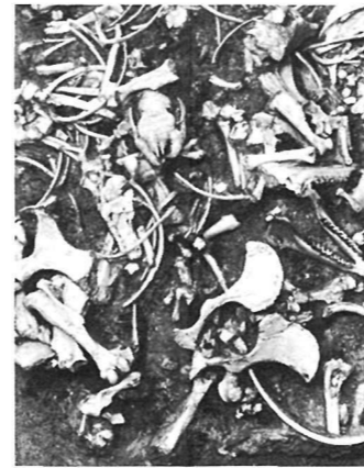
Typical portion of a fossil layer.

Several other institutions sent collecting parties to Agate in later years. The last excavation was made at the Stenomylus quarry in 1950 by the South Dakota School of Mines and Technology.