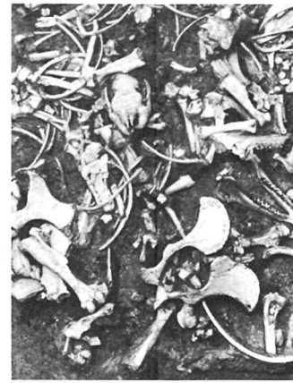
Typical portion of a fossil layer.

Several other institutions sent collecting parties to Agate in later years. Visitors are welcome at sites being currently excavated when the paleontologists are working.