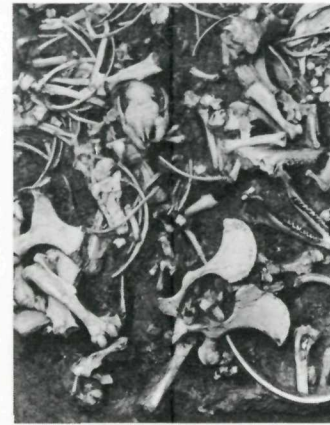
Typical portion of a fossil layer.

Several other institutions sent collecting parties to Agate in later years. Visitors are welcome at sites being currently excavated when the paleontologists are working.