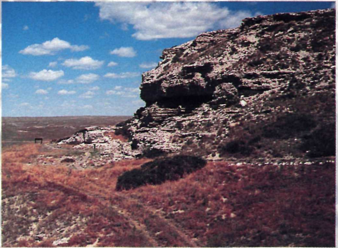
The Carnegie Hill Fossil Quarry