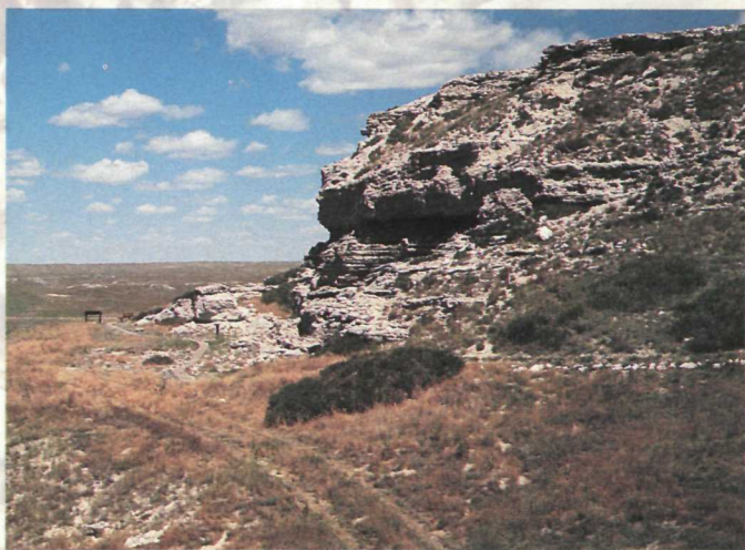
The Carnegie Hill Fossil Quarry