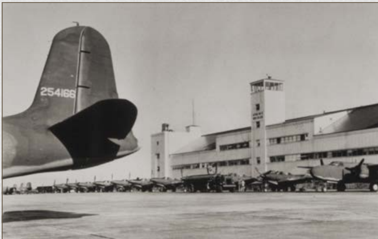
Lend-Lease planes on the apron of Hangar 1, Ladd Field, Fairbanks, circa 1944, including A-20s and P-39s.