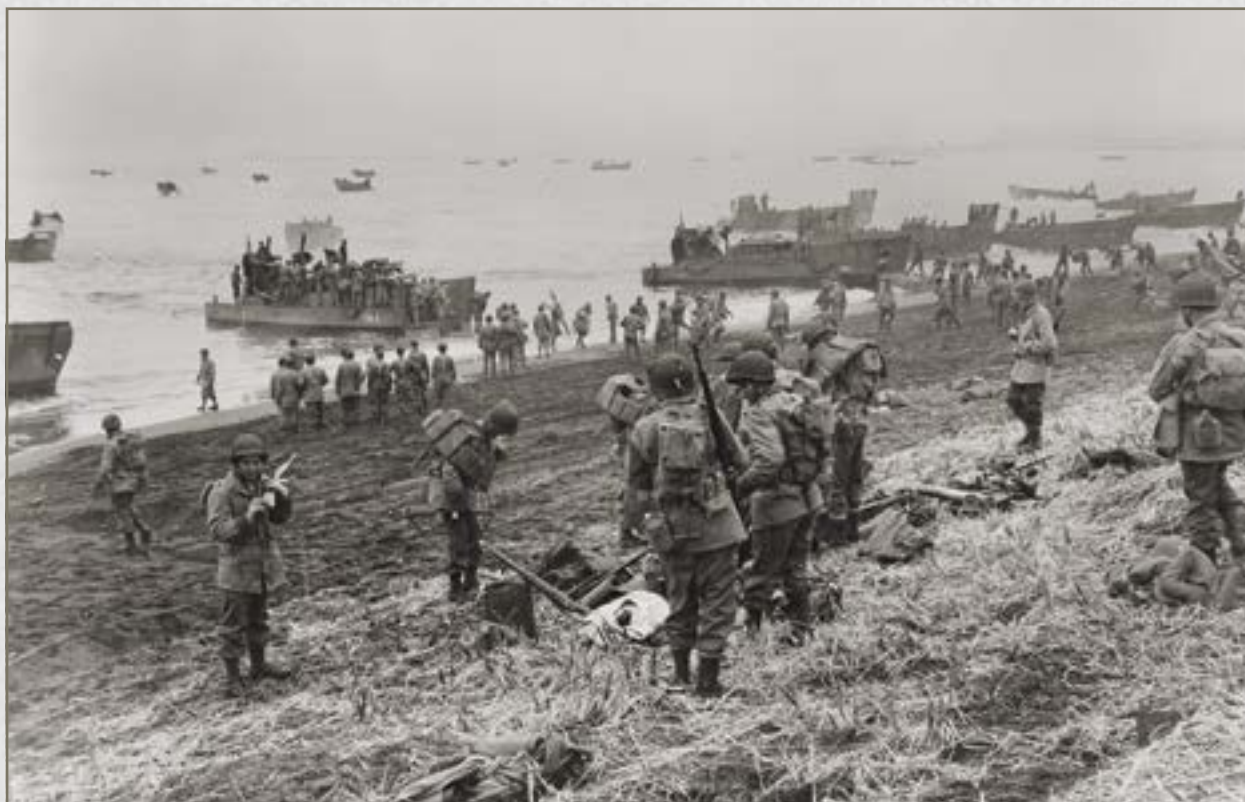
Attu, Aleutian Islands. Landing boats pouring soldiers and their equipment onto the beach at Massacre Bay. This is the Southern landing force.