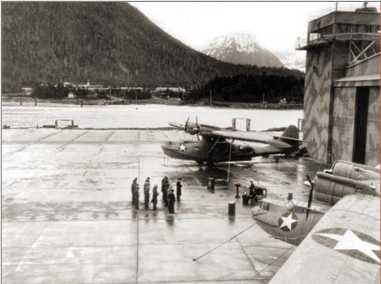
Sitka Naval Operating Base, Easter Service, 1943.

SLED offers access to library catalogs and other resources of interest to Alaskans under the slogan "information resources for, about and by Alaskans."