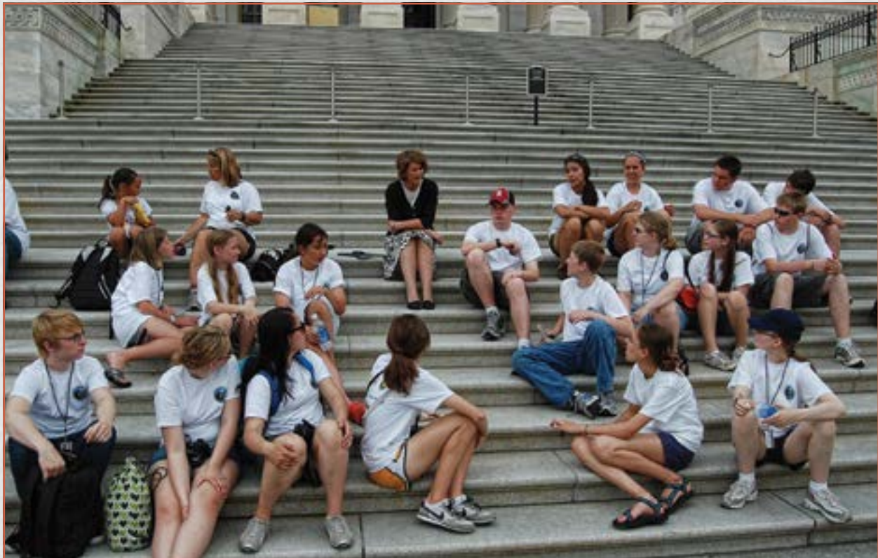
Alaska Senator Lisa Murkowski visiting with Alaska's National History Day students on the Capitol Steps in Washington, D.C.

The National Park Service is a partner of National History Day. In Alaska, the National Park Service, Alaska Regional Office partners with the Alaska Association for Historic Preservation to bring the History Day program to schools across the state . Teachers may contact the state coordinator to request History Day curriculum guides or ask questions about the program by visiting the History Day in Alaska website at http://www.alaskahistoryday.com/