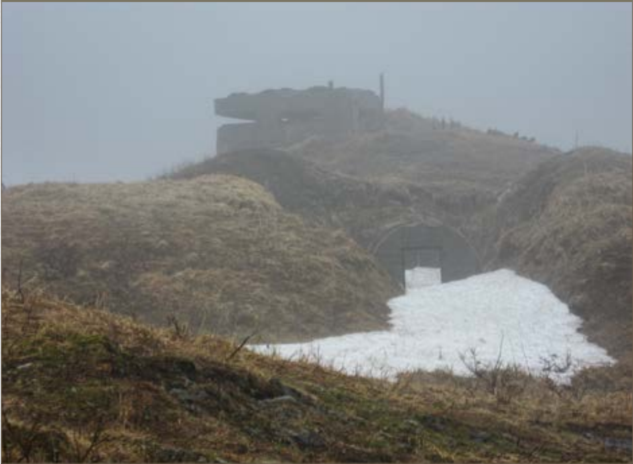
Ulakta Head and Command Center, a feature within the Dutch Harbor NHL and the Aleutian World War II National Historic Area.

The Secretary of the Interior, through the National Park Service, designated the following NHL sites to commemorate the significant events and human drama of Alaska's role in World War II: