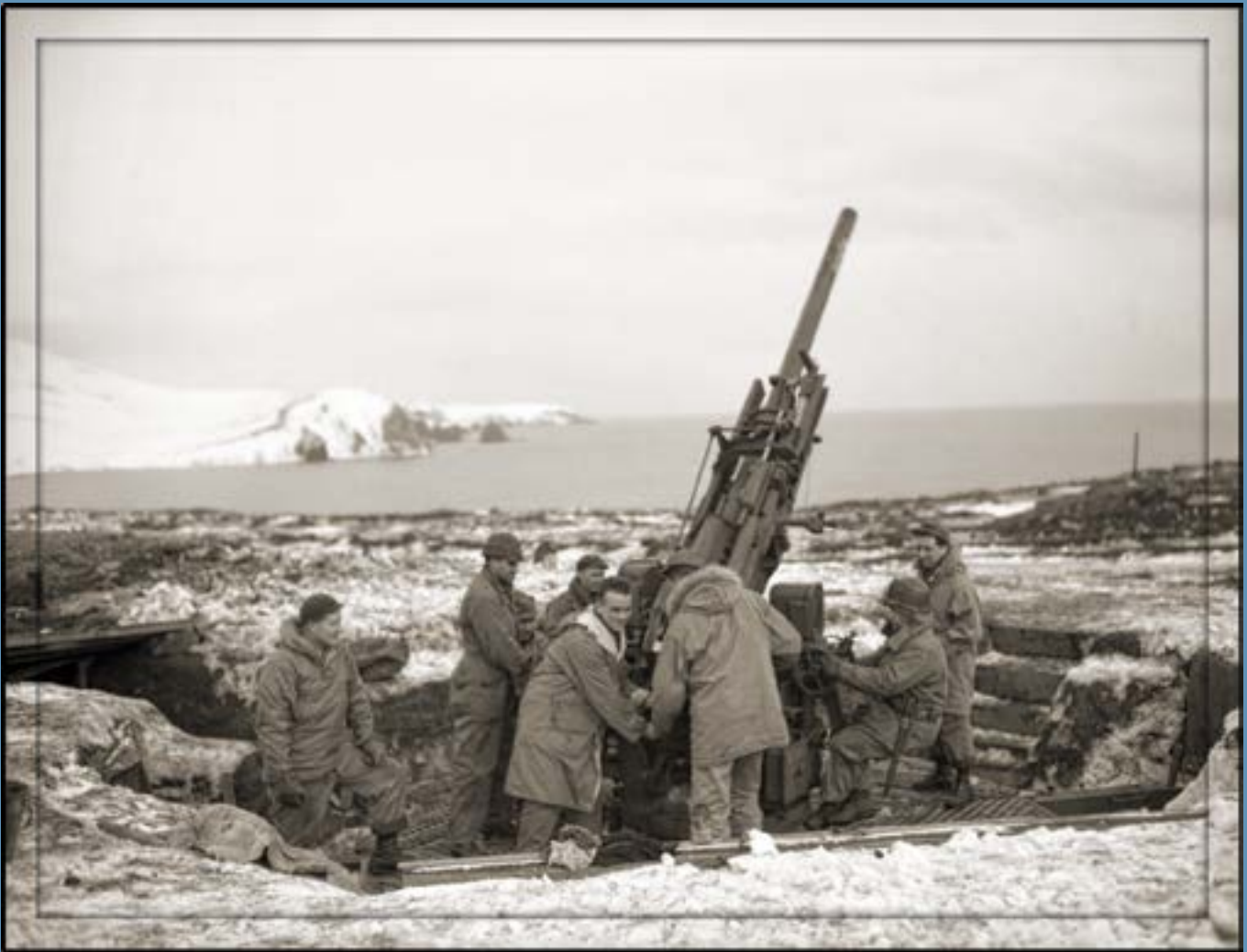
The Aleutian Campaign involved tens of thousands of U.S. land, sea, and air forces in defending Alaska from the enemy. Pictured are U.S. soldiers on Kiska with anti-aircraft gun emplacement, following Japanese evacuation of the island in 1943.