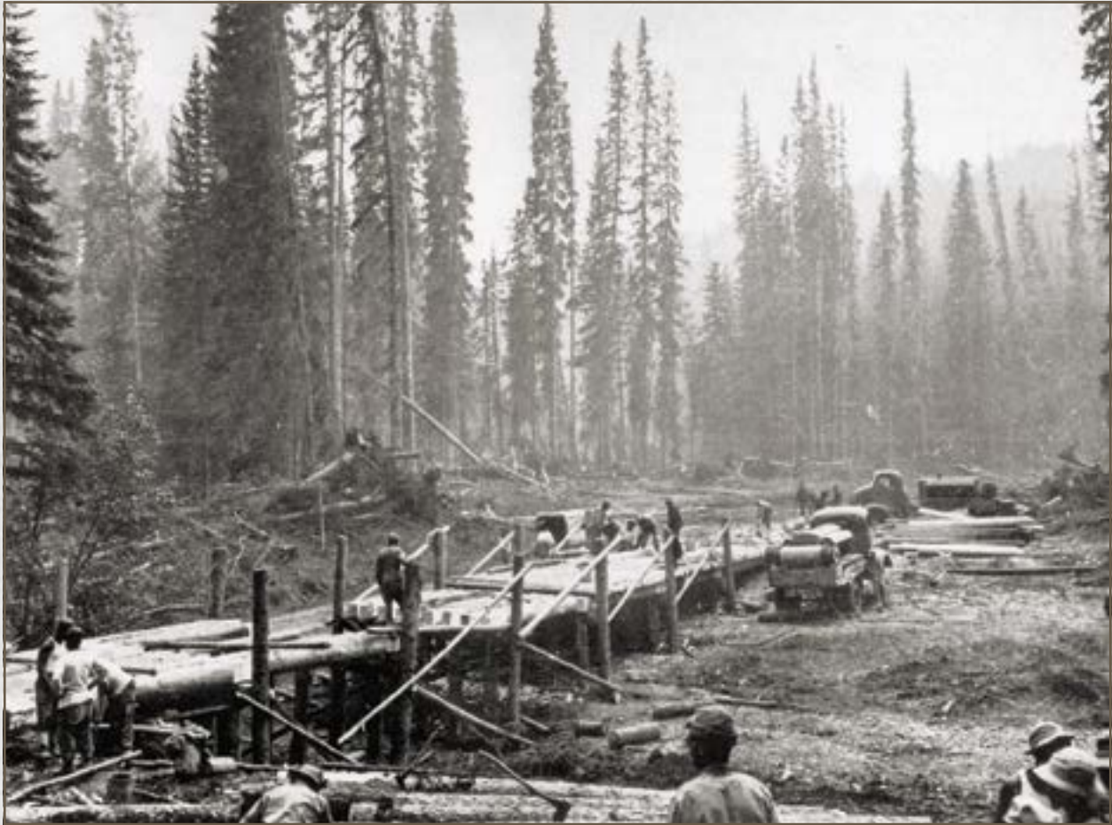
Black engineers build a trestle bridge during the construction of the Alaska Canada Military Highway. Black G.I.s made up roughly forty percent of the estimated 11,500 Army troops who in just nine months completed a wilderness highway linking Alaska with the contiguous United States. (Anchorage Museum of History and Art)

Hollinger, Kristy. The Haines-Fairbanks Pipeline . Fort Collins, CO: CEMML, Colorado State University, 2003.