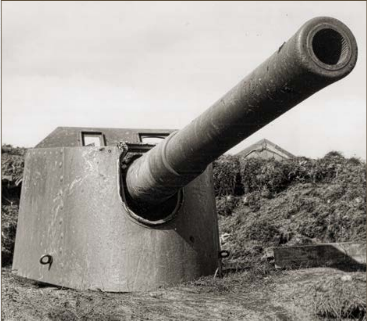
“Among the Japanese placed guns on Kiska Island was this 125-mm (6-inch) pre-World War I British naval gun used by the Japanese to guard the entrance to Kiska Harbor.” Photo taken by NAS Adak, 7 September 1943. (NARA, Record Group 80-G-80384)