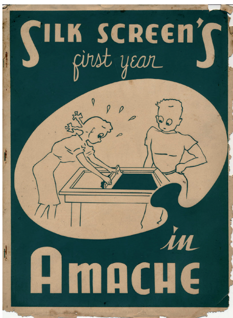
AMACHE SILK SCREEN SHOP

The Association of Print Scholars Collaboration Grant funds public programs and projects that foster collaboration between members of the print community and/or encourage dialogue between the print community and the general public.