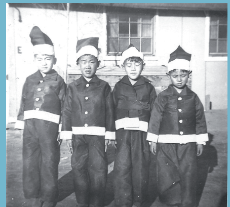
Amache children ready for the holiday program.

Amache Preservation Society PO Box 259 Granada, CO 81041-0259