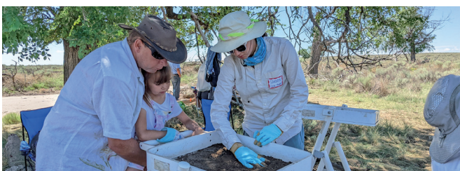
VISITORS TRY THEIR HAND AT SCREENING ARTIFACTS

The Amache Archaeology Project is getting ready for its 8th field season at the site and museum, from June 17 – July 13, 2024. This summer we will be researching three barracks blocks: 6F, 7F, and 8E. If you, your family, or someone you know lived in one of these blocks please reach out! We are always looking for photographs, memories, or any information that can help us tell the story of these blocks and their residents.