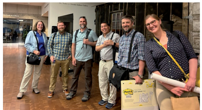
NPS staff and planners with members of the Amache Alliance Board at the Foundation Document public meeting held in Los Angeles.

a summary of civic engagement outcomes and reconvene with workshop participants to make final refinements to draft Foundation Document content in June thru July.