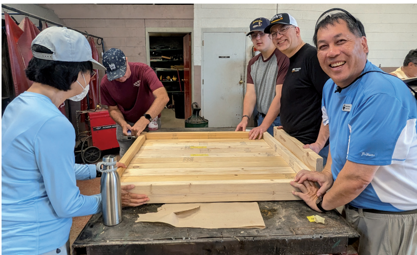
Volunteers construct furniture for the Amache barrack.