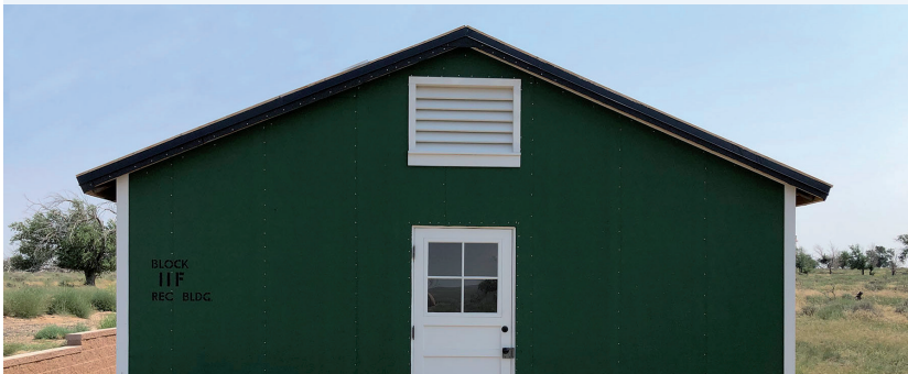
AMACHE RECREATION HALL EXHIBIT CONCEPT PLAN