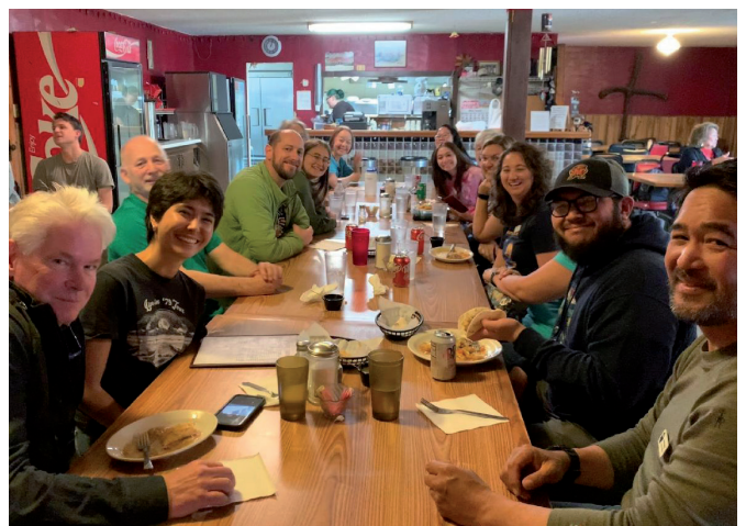
Pilgrimage attendees enjoy lunch at Shorty's Cafe in Granada.

This year, because of increased interest in Amache due to the publicity surrounding its national historic site designation, additional events were added to the pilgrimage. Several organizations including the Amache Alliance, National Park Conservation Assoc., Colorado Preservation Inc., and the University of Denver Amache Project provided opportunities to learn more about the Amache site and its community. Friday morning started off with about 25 volunteers helping to prepare for the pilgrimage weekend events. It was more like a social event of friends gathering to support APS and the town. Plenty of laughs and memories to go around, along with plenty of dust (just like our relatives had to deal with at