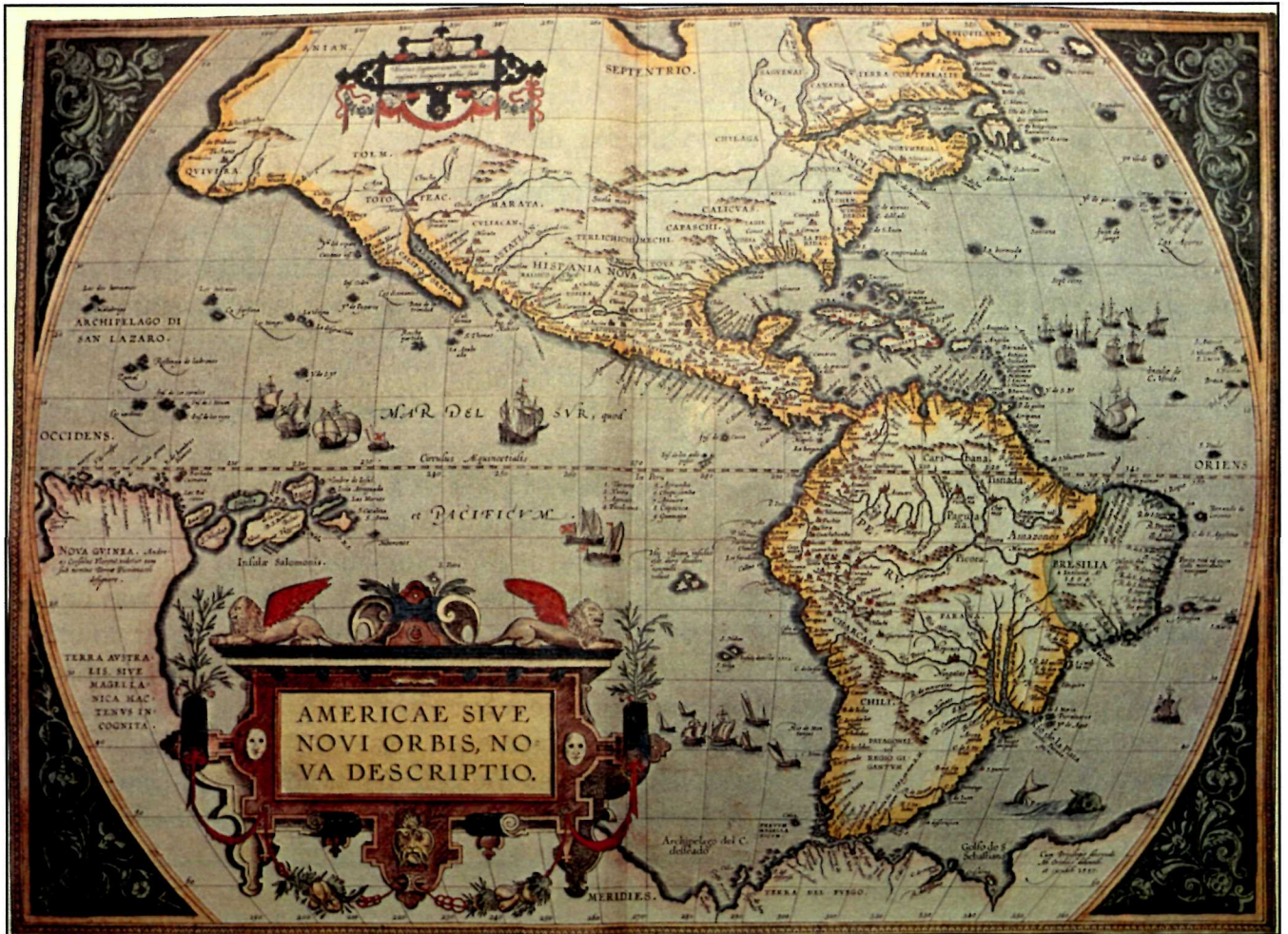
Americae Sive Novi Orbis , ca. 1570, by Abraham Ortelius. Copy available in Map Collection, NPS Spanish Colonial Research Center, University of New Mexico.