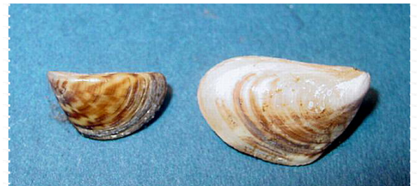
Zebra Mussel, left; Quagga Mussel, right.

For more information: http://100thmeridian.org