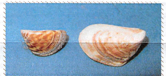
Zebra Mussel, left; Quagga Mussel, right.

For more information: http://100thmeridian.org