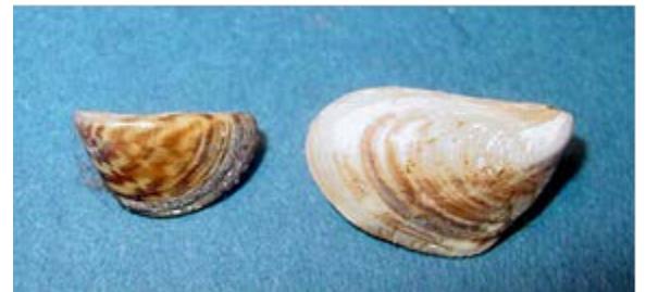
Zebra Mussel, left; Quagga Mussel, right.

For more information: http://100thmeridian.org