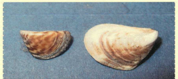
Zebra Mussel, left; Quagga Mussel, right.

For more information: http://100thmeridian.org