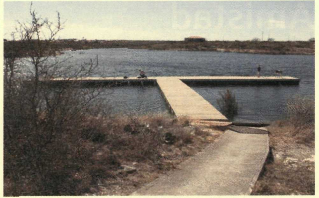
Blackbrush Fishing Dock

Good bank fishing available at Black Brush Point below the picnic shelters, below the Viewpoint Road picnic shelters at Diablo East, on the north side of Hwy 90 just west of the Rock Quarry Group Campsite, and the cove behind campsite #3 at the San Pedro Campground, among others.