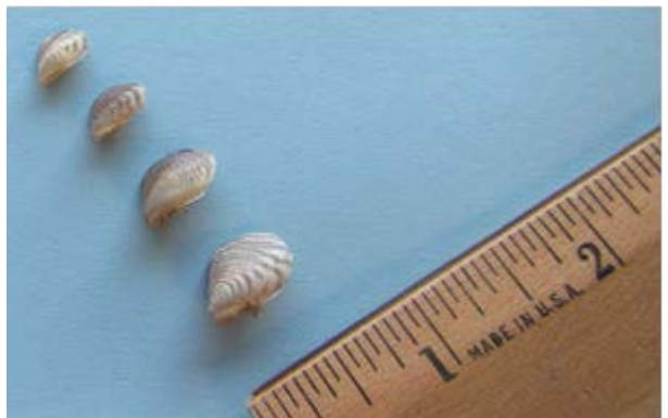
Example of Zebra Mussel

Zebra mussels have been found in Texas,in Canyon Lake, Lake Taxoma, Ray Roberts, Lewisville, Bridgeport, Belton, Lavon, Waco and Dean Gilbert. As far as we know, there is no quagga or zebra mussel in Lake Amistad at this time. We would like to keep it that way.