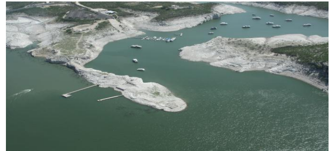
Rough Canyon Marina