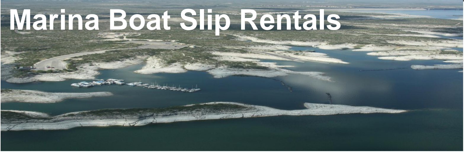
Diablo East Marina