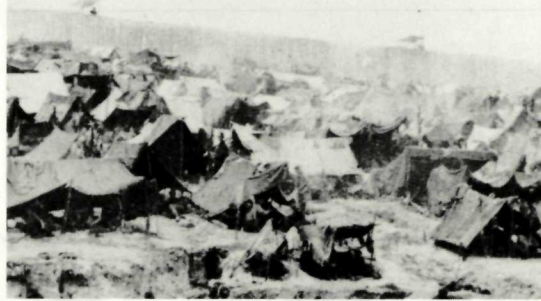
Andersonville Prison Camp, August 17, 1864

Andersonville, or Camp Sumter as it was known officially, was the largest of several Confederate military prisons established during the Civil War. It was built in 1864 after Confederate leaders decided to move the large number of Federal prisoners in Richmond to a place of greater security and more abundant food. During the 14 months of its existence, more than 45,000 Union soldiers were confined here. Of these, more than 12,000 died from disease, malnutrition, overcrowding, or exposure.