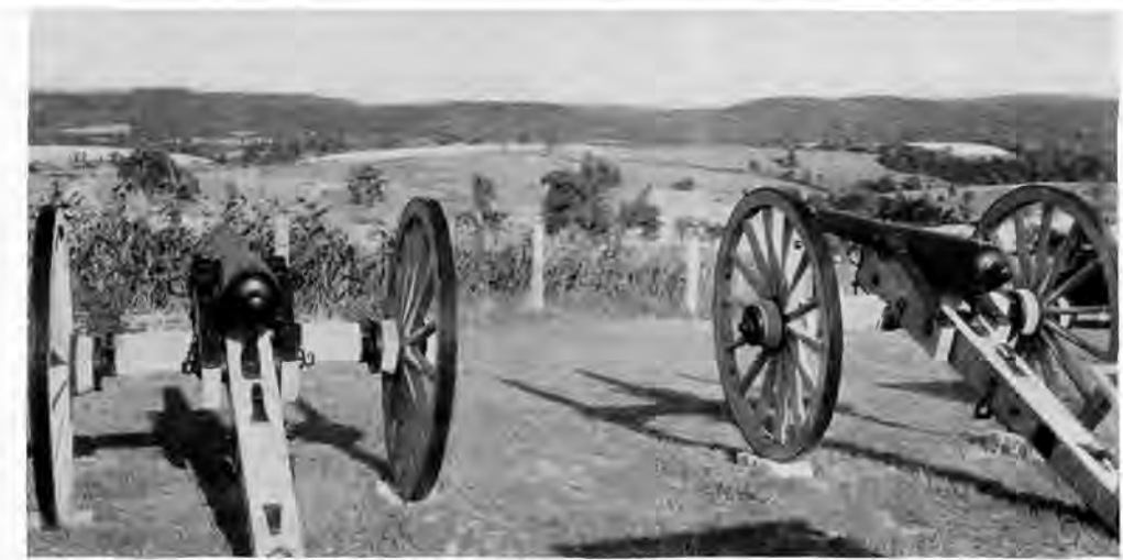
Confederate Battery Position, Harpers Ferry Road, and Branch Avenue.

as could have been done with a knife, and the slain lay in rows precisely as they had stood in their ranks a few moments before." Hooker's troops advanced, driving the Confederates before them, and Jackson reported that his men were "exposed for near an hour to a terrific storm of shell, canister, and musketry."