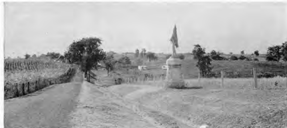
Bloody Lane today. This photograph is taken from almost the same angle as the picture on the cover.

Antietam National Battlefield Site is one of the historical, scenic, and scientific areas administered by the National Park Service of the Department of the Interior for the benefit and inspiration of the American people. Communications should be addressed to the Superintendent, Antietam National Battlefield Site, Sharpsburg, Md.