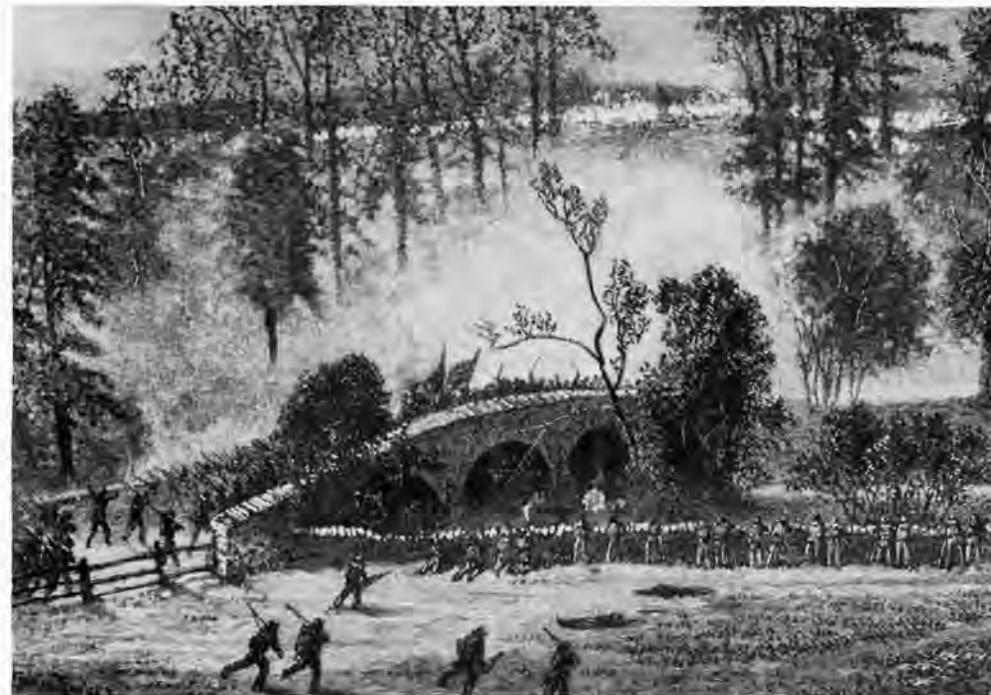
The charge across the Burnside Bridge. From a sketch made at the time.

At dawn on the 17th, Hooker's artillery opened fire on Jackson's troops posted in a cornfield north of the town of Sharpsburg. Hooker reported: "In the time I am writing every stalk of corn in the northern and greater part of the field was cut as closely