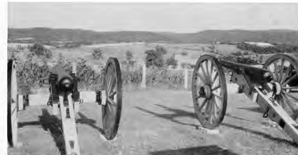
Confederate Battery Position, Harpers Ferry Road and Branch Avenue.

At dawn on the 17th, Hooker's artillery opened fire on Jackson's troops posted in a cornfield north of the town of Sharpsburg. Hooker reported: "In the time I am writing every stalk of corn in the northern and greater part of the field was cut as closely