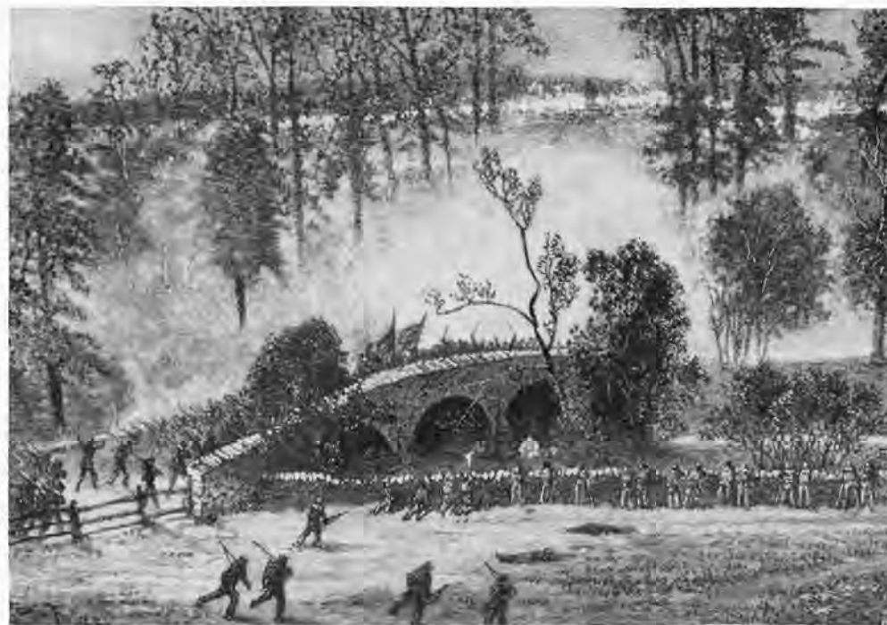
The charge across the Burnside Bridge. From a sketch made at the time.

More men were killed and wounded at Antietam on September 17, it is said, than on any other single day of battle during the war. Federal losses in killed and wounded were 12,410, or 15.4 percent of those engaged; Confederate losses in killed and wounded were 10,700, or 26.1 percent of those engaged