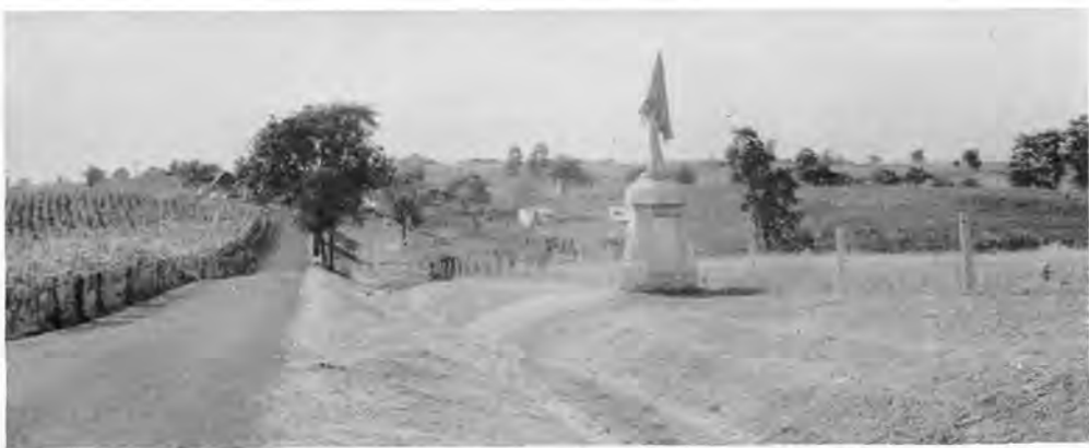
Bloody Lane today. This photograph is taken from almost the same angle as the picture on the cover.