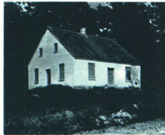
WARTIME PHOTO OF THE DUNKER CHURCH

The battle opened at dawn on the 17th as Hooker's artillery began a murderous fire on "Stonewall" Jackson's troops posted in a cornfield north of town. The battle raged southward all day—from the North Woods, through the Cornfield, the East Woods, the West Woods, past "Bloody Lane" and Burnside Bridge, to the hills below Sharpsburg where at last it ended. The timely arrival of A. P. Hill's division stopped the final Union assault just short of victory. Neither side had gained the upper hand, but Lee was turned back into Virginia. Losses on both sides were staggering: 12,410 Federals were killed or wounded (15 percent of those engaged) and 10,700 Confederates (26 percent of those engaged).