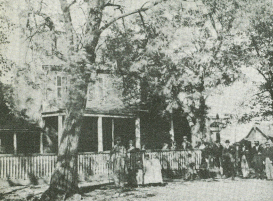
Clover Hill Tavern, April 1865.