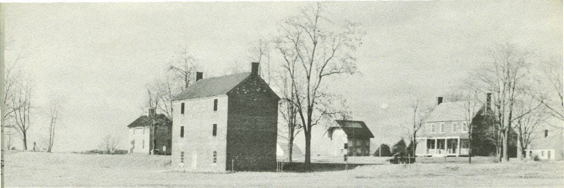
Village of Appomattox Court House, 1954.