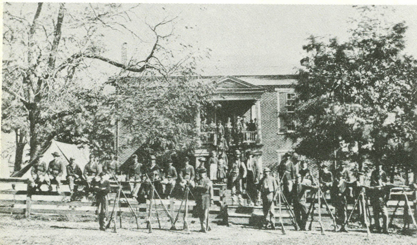
Courthouse building, April 1865.

Inside, Lee rose to meet the man whose armies he had fended off for nearly a year.