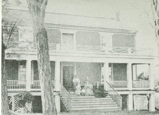
McLean House, 1865.

Memories of those desperate, bloody battles that followed the meeting engagement in the Wilderness on May 5 the preceding year must have raced through his mind as he faced the northern general. Lee was dressed in an immaculate uniform. His sword was buckled to his side. Standing there poised and outwardly calm, Lee left an imperishable picture of a gentleman-soldier.