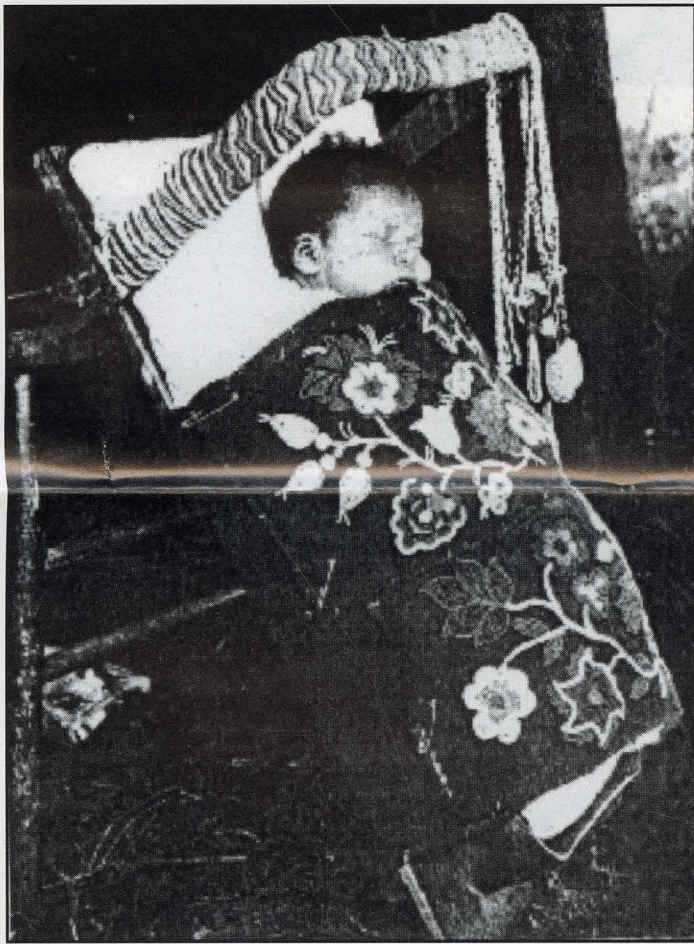
Ojibwe child in cradleboard (Cover Photo: Tribal representatives from Great Lakes tribes at treaty signing ceremony in Washington D. C.)

This area named the Apostle Islands is home for some of the Ojibwe people who live throughout the Great Lakes. According to their written and oral history the Ojibwe were the original inhabitants of this area. In order to gain the materials they needed to survive, they traveled throughout the islands with their main village being Madeline Island, which is known as Moningwinikoning "home of the yellow breasted woodpecker."