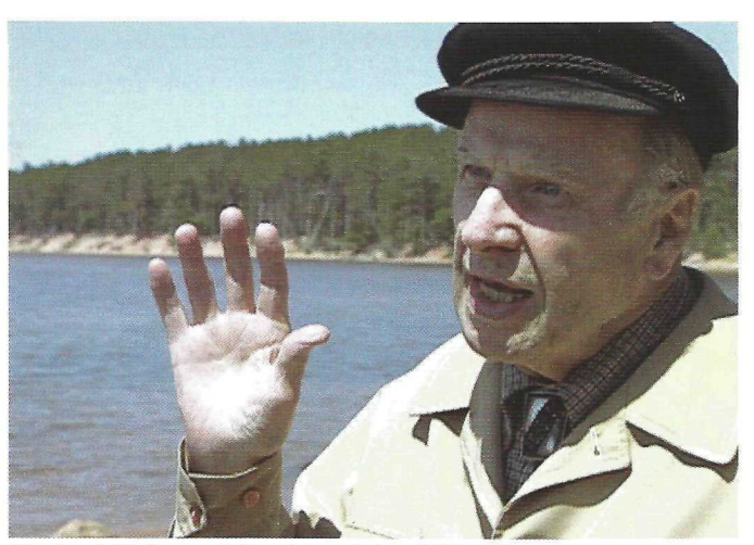
Gaylord Nelson at Stockton Island (2003)

Former Wisconsin Governor and U. S. Senator Gaylord Nelson