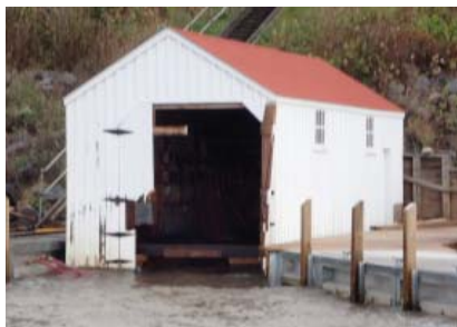
Raspberry Island boat house suffered severe damage.

People have harvested blueberries for generations within the islands. Stories of families picking berries tell of camping and coming together to harvest; they also tell of fire. Along with other forest species, blueberries respond to fire on the landscape. Native Americans used fire to promote the berry harvest on Stockton Island for centuries. This burn marks the beginning of a connection to the landscape that reflects a parallel between Native cultural practices and the mission of the National Park Service. With this success, the lakeshore plans to implement more burning across the Stockton Island tombolo.