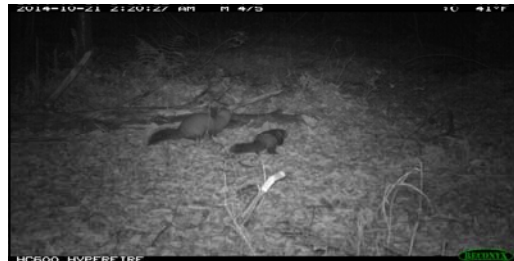
Stockton Island 2014-2015