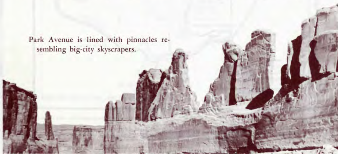
Park Avenue is lined with pinnacles resembling big-city skyscrapers.

Delicate Arch—notice the figure of a park ranger under it.